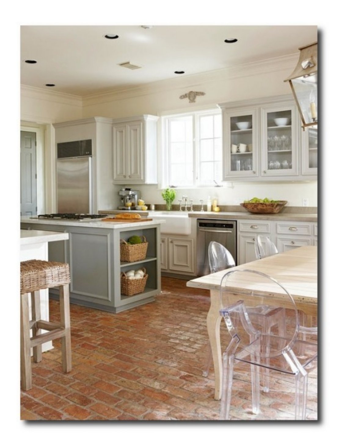
Sally Wheat Interiors, - bhg.com