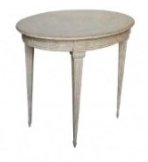
CUPBOARDS & ROSES

Pine Painted Miniature Armoire Oval Table with Classical Detail