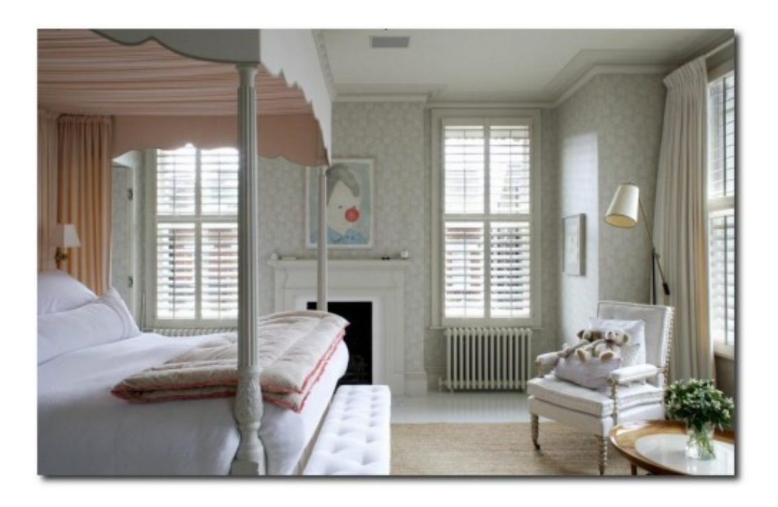
Annabels House White Decorating Ideas 1st-option.com