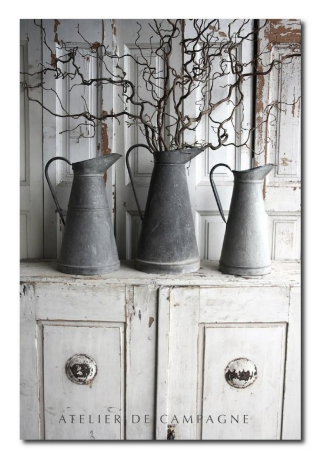
ATELIER DE CAMPAGNE