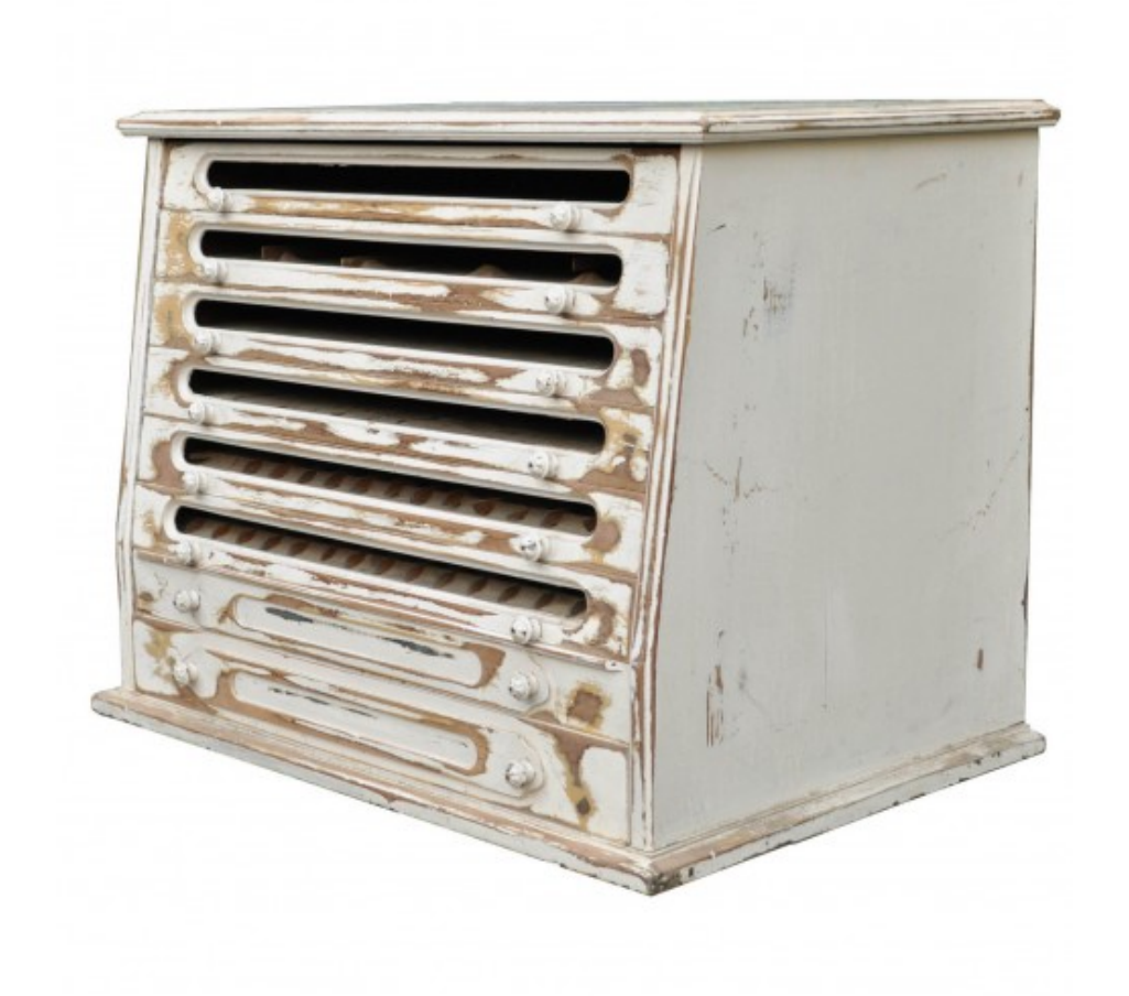
Primitive Chest From Quality Is Key On Ebay