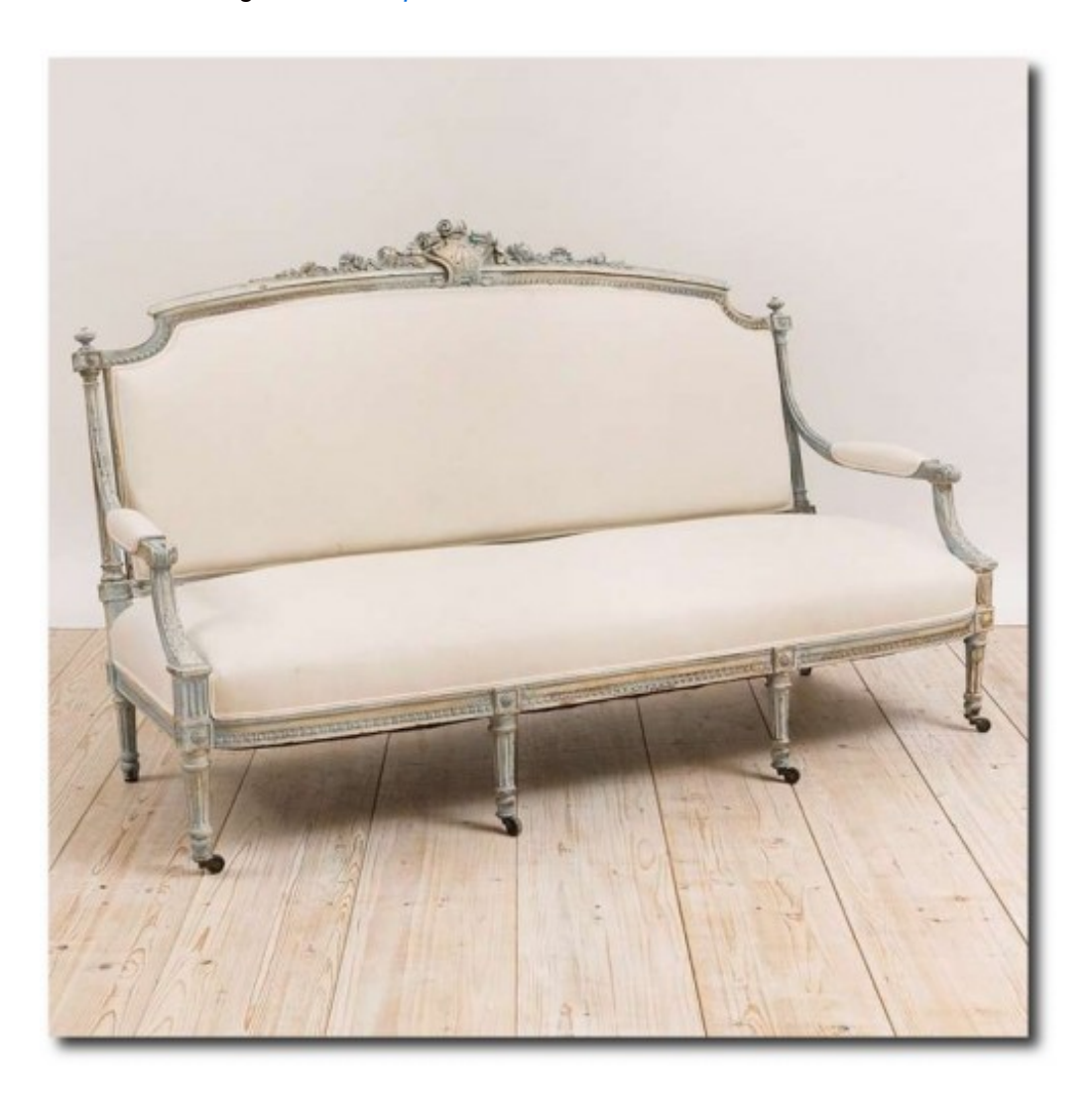
French Louis XVI Style Upholstered Sofa in Painted Finish