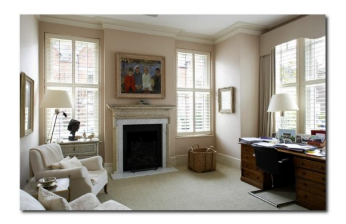
Annabels House White Decorating Ideas 1st-option.com