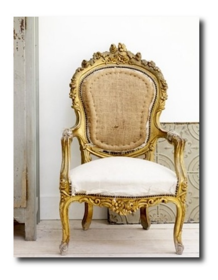
Italian Distressed Chair In Burlap and Gilt Wood- Unknown Designer