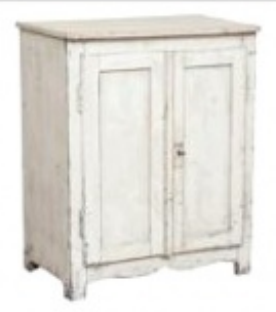
THE GREAT BRITISH PINE MINE