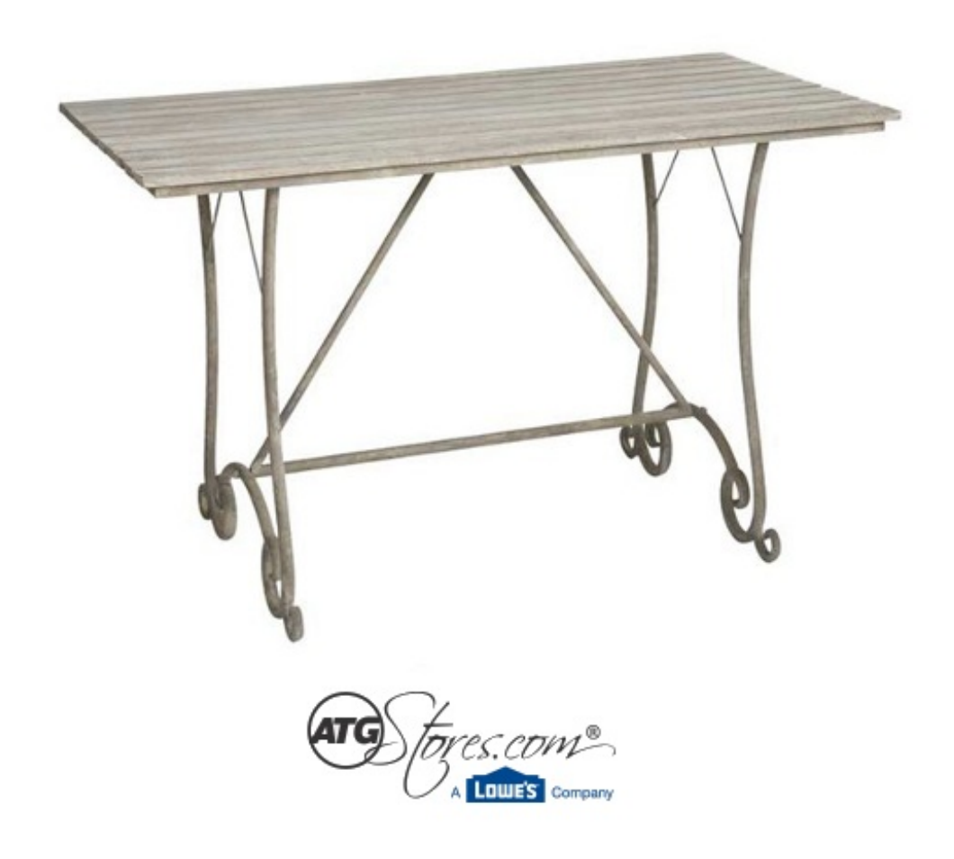
Midwest CBK 304150 Distressed Greywash Rectangular Table $238 From ATG Stores