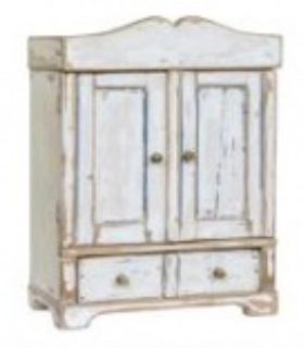
THE GREAT BRITISH PINE MINE