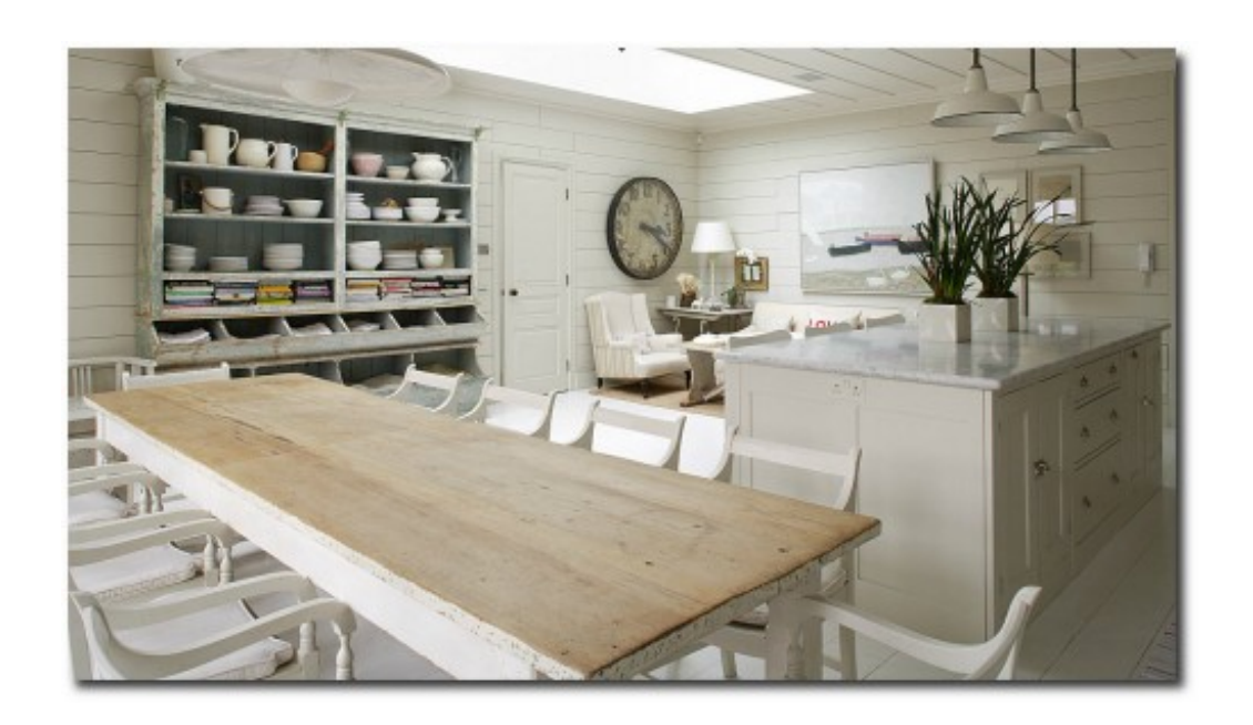
Annabels House White Decorating Ideas 1st-option.com