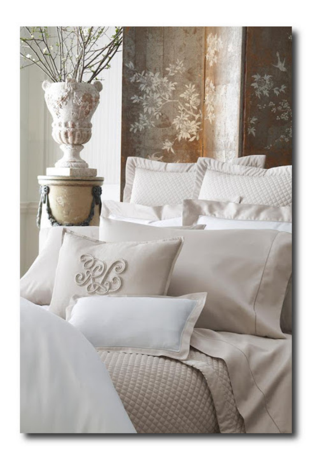
The Ralph Lauren Signature Classics Line