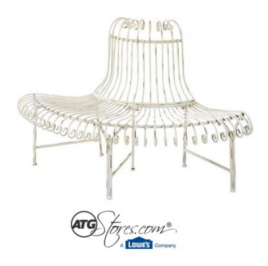
Midwest CBK 292464 Around The Tree Bench $362 From ATG Stores