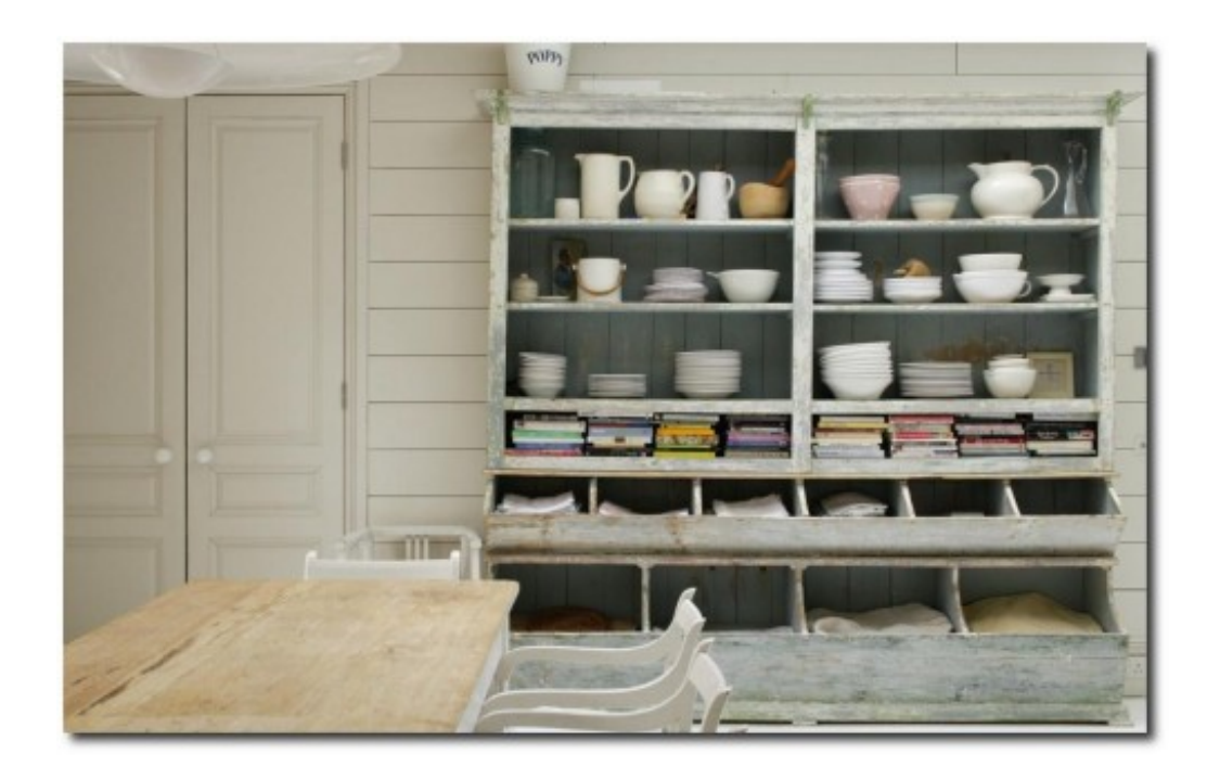
Annabels House White Decorating Ideas 1st-option.com