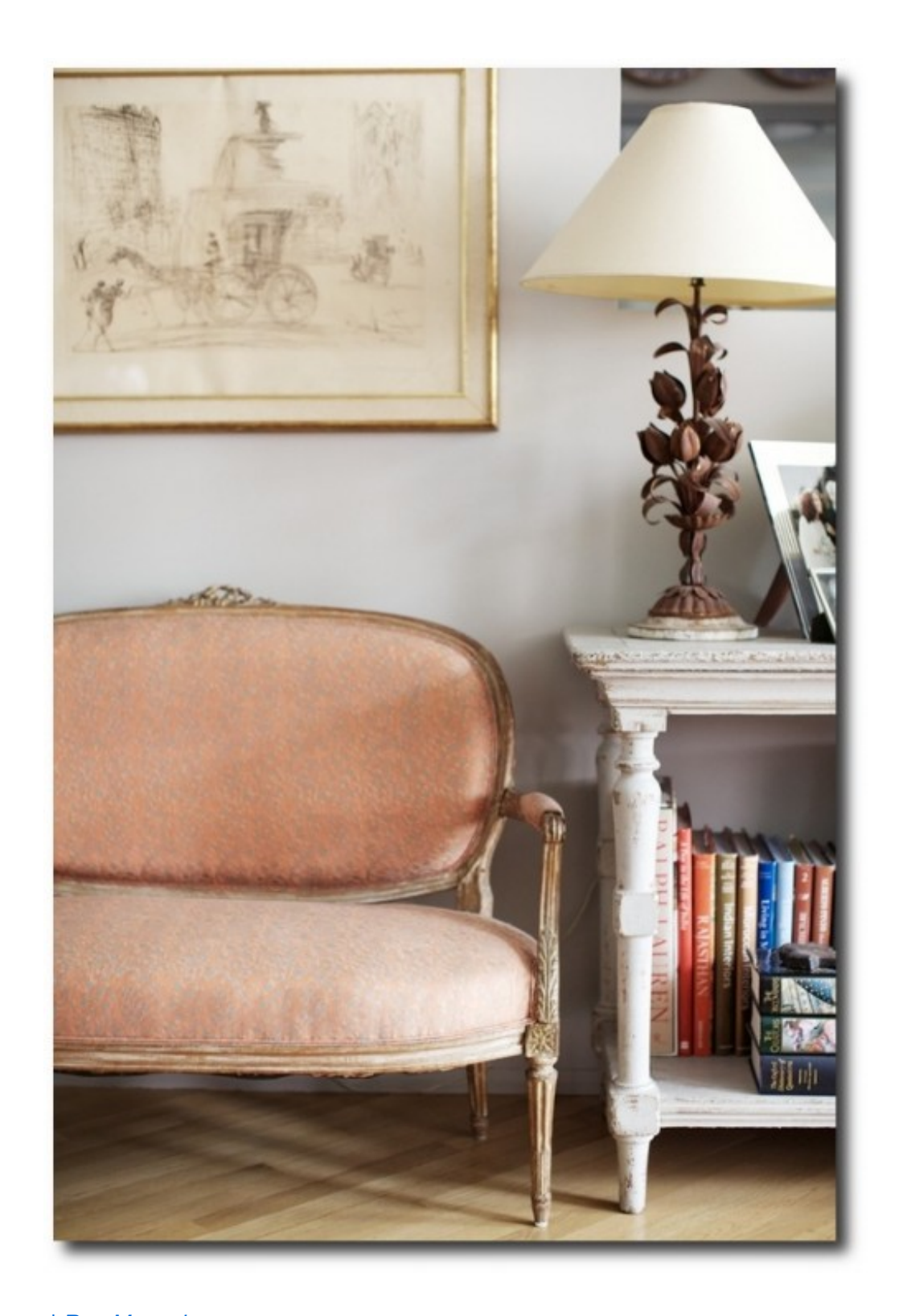
Old World Charm | Rue Magazine