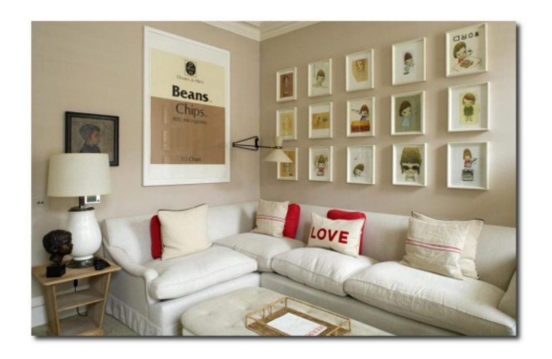
Annabels House White Decorating Ideas 1st-option.com