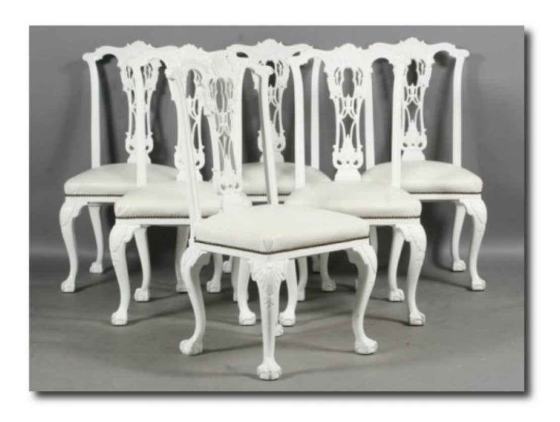
6 Chippendale White Dining Chairs Seen on Live Auctioneers

Unlike decorating kitchens and living rooms, decorating bathrooms is a bit more challenging. First of all, there's one thing you should be aware of: bath furniture is prone to extreme humidity, so it's extremely important to select waterproof pieces. Avoid hardwood because it's expensive and it will bloat. Why throw important sums of cash out the window when you can stay safe with additional materials like plastic, bamboo, and wicker?