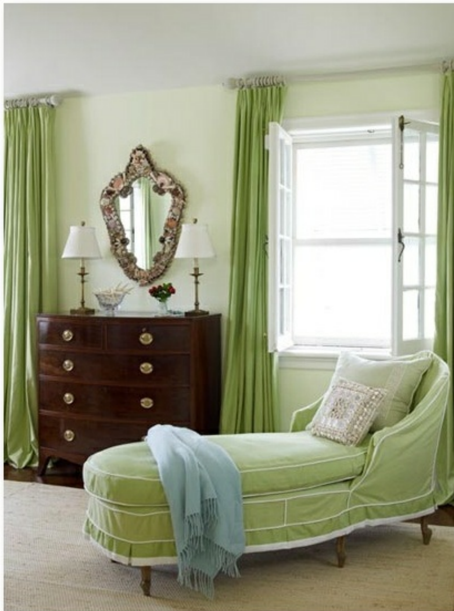
French chaise with a custom slipcover and white piping- megbraff.com