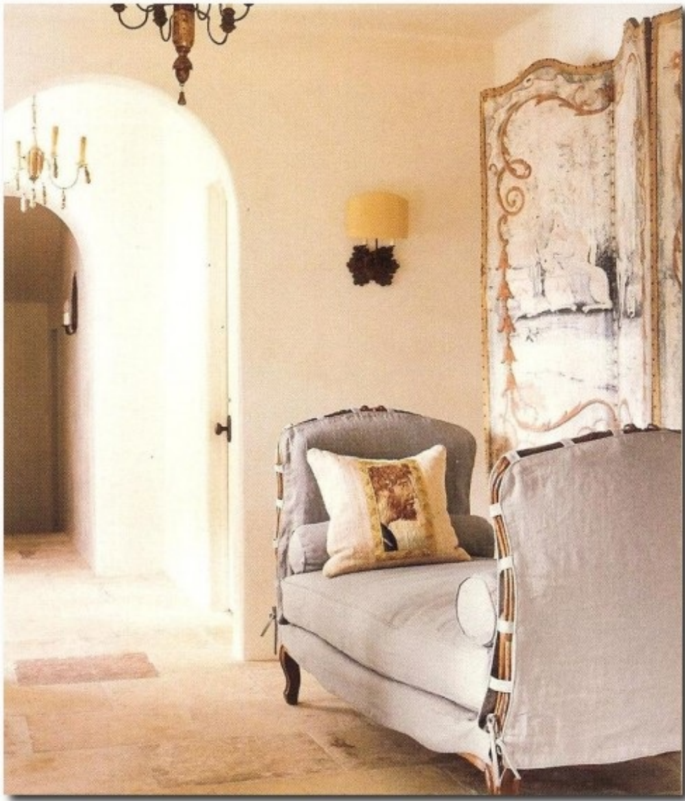
Antique Daybed, – Kay O'Toole Antiques