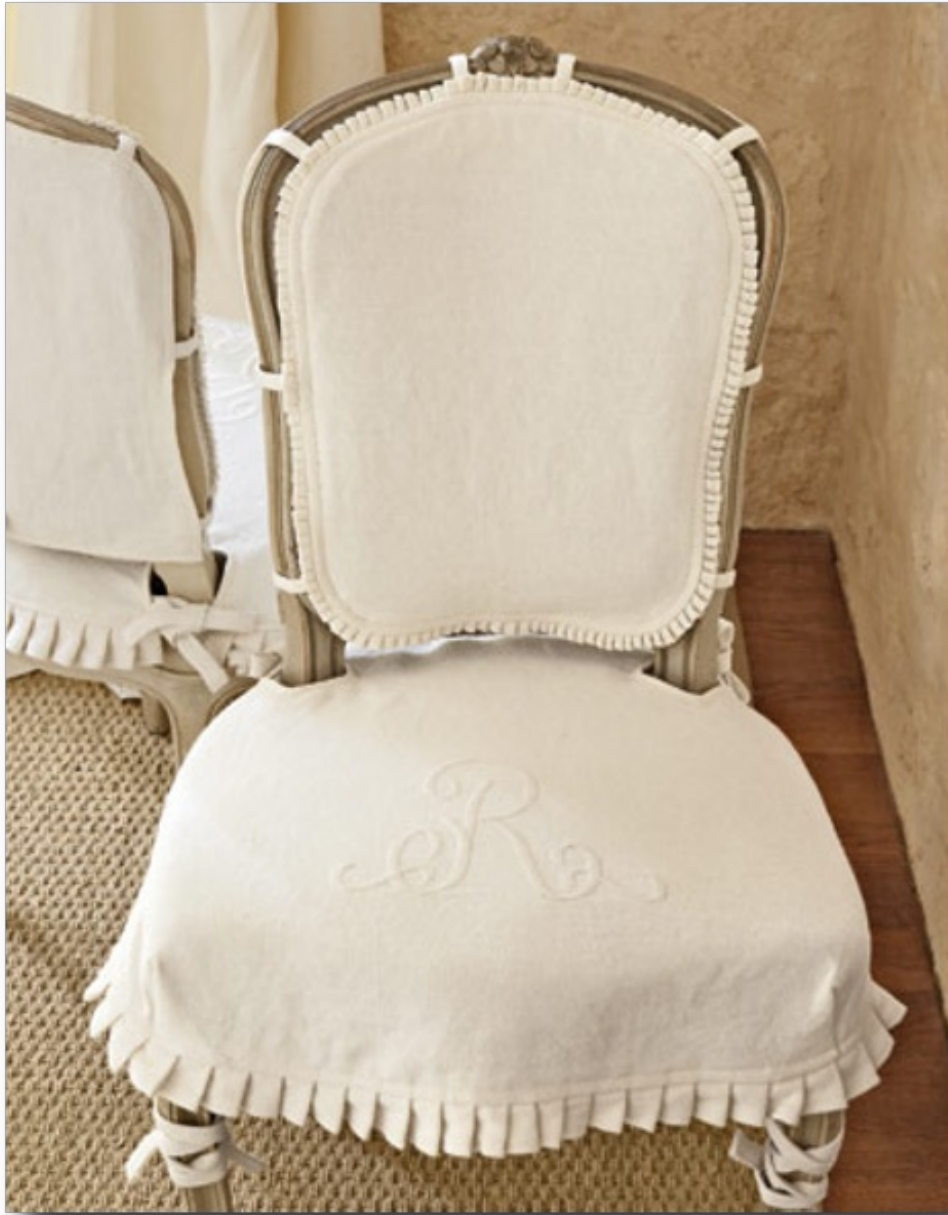
Linen Slipcovers From Country Living Magazine