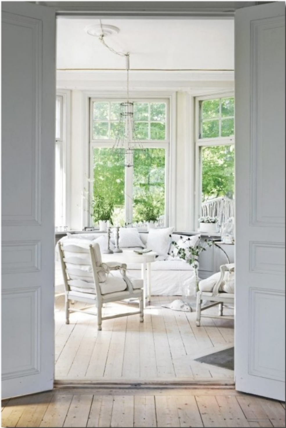
Swedish Inspired Home With Slipcovers