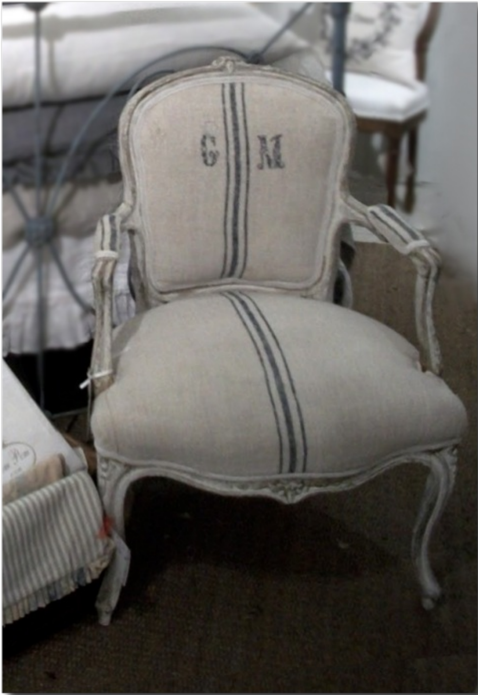
French Chairs