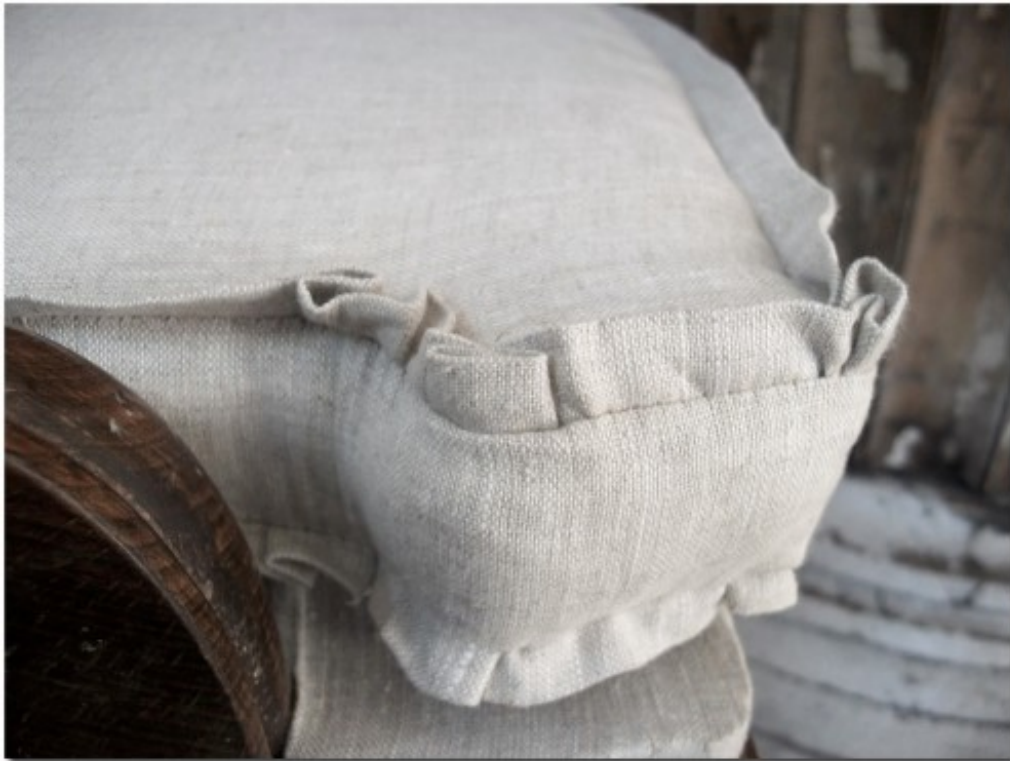
French Chairs