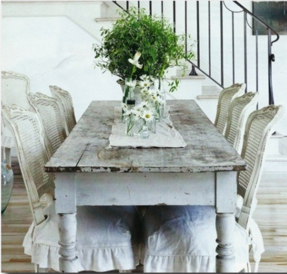
French Slipcovers On Dining Chairs- Rachel Ashwell