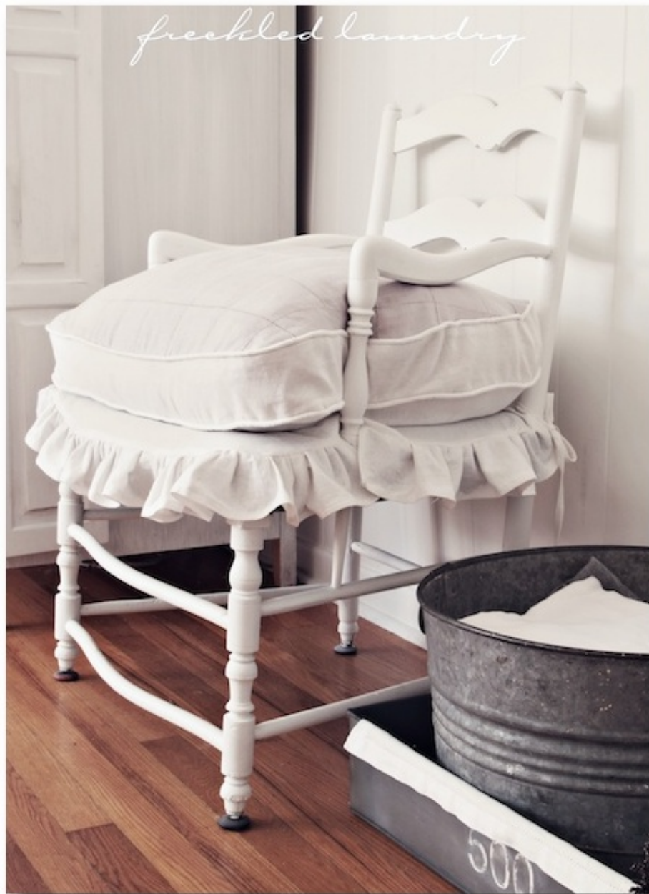
Lavender & white slipcovered chair- freckledlaundry.com