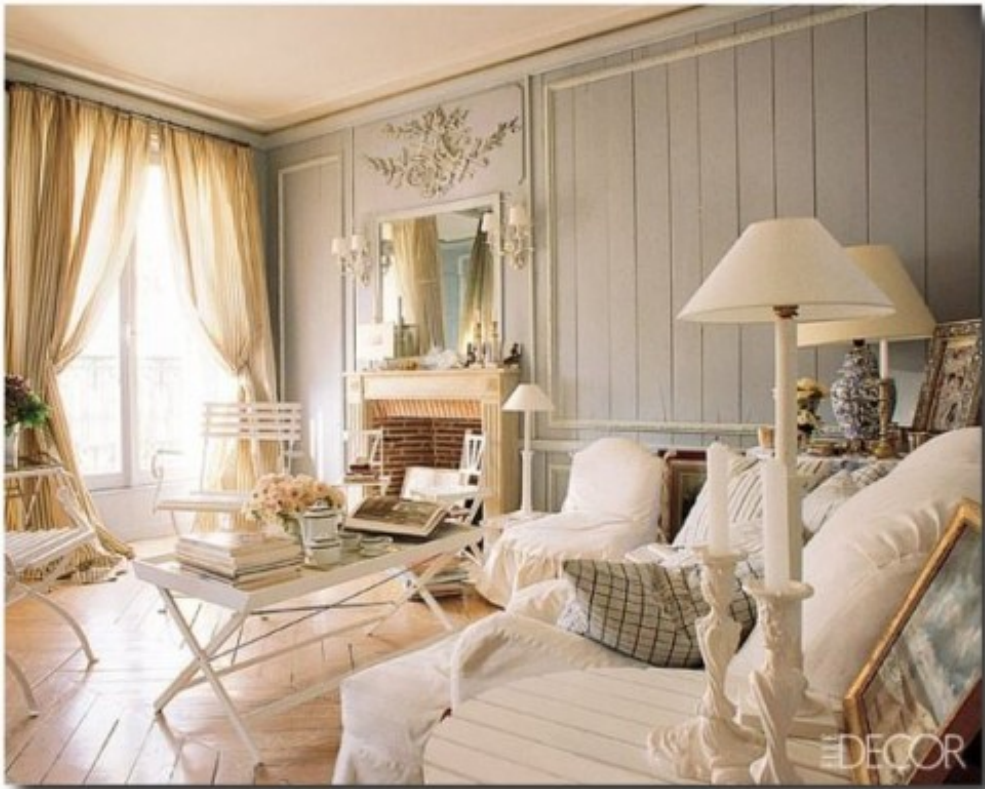
Apartment of Inès de la Fressange—fashion designer, model ELLE DECOR