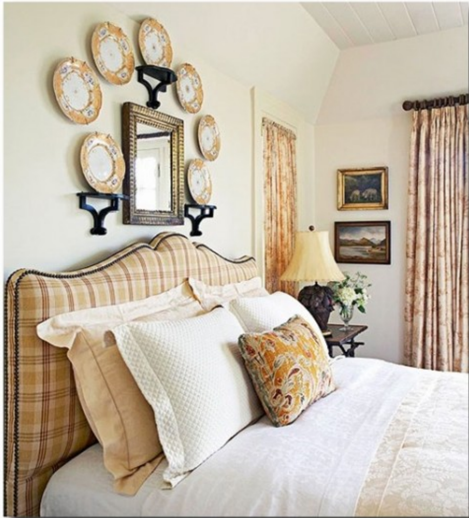
Ten Things to Hang Above the Bed | BHG