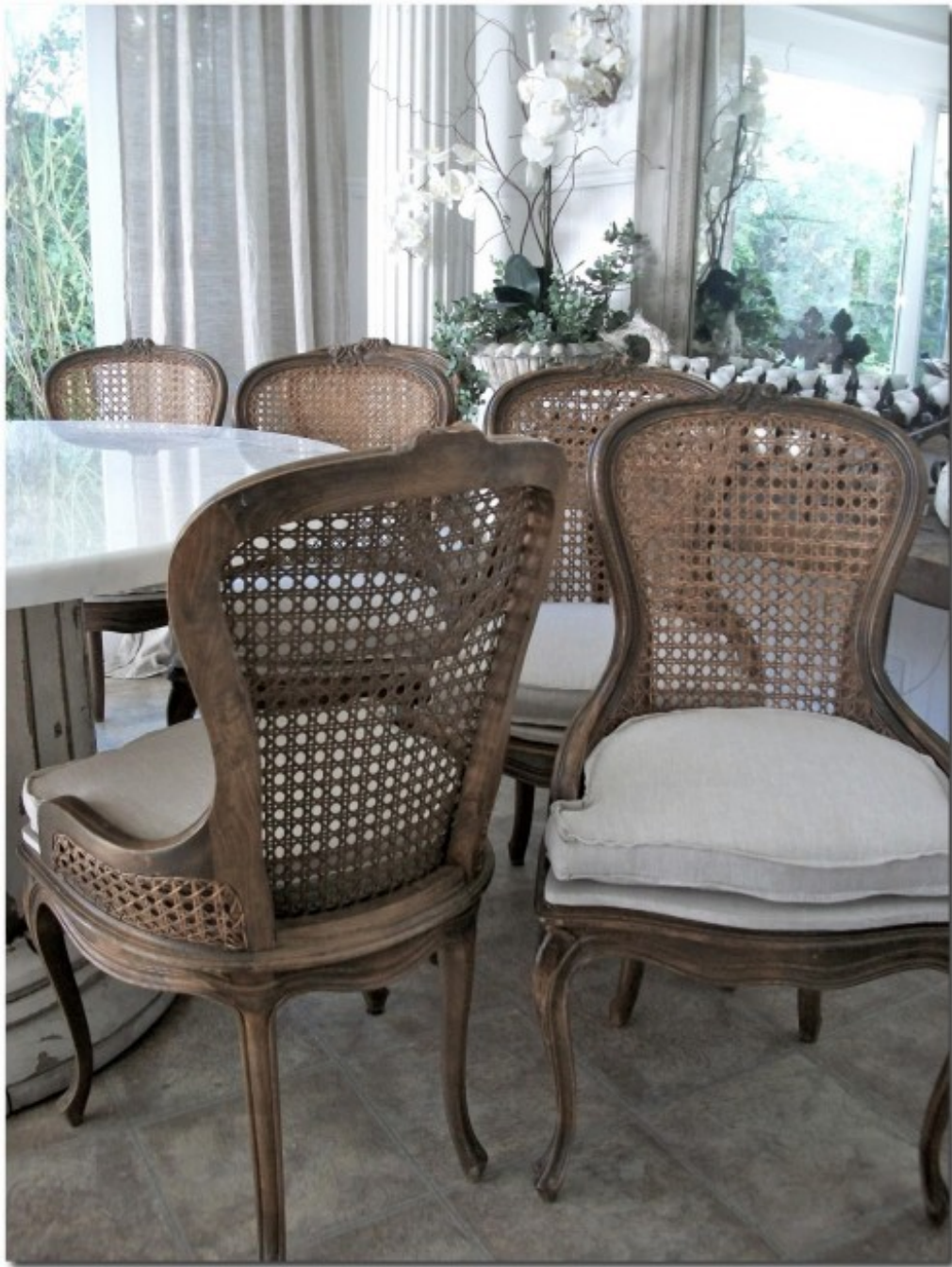
French Chairs From Full Bloom Cottage Blog