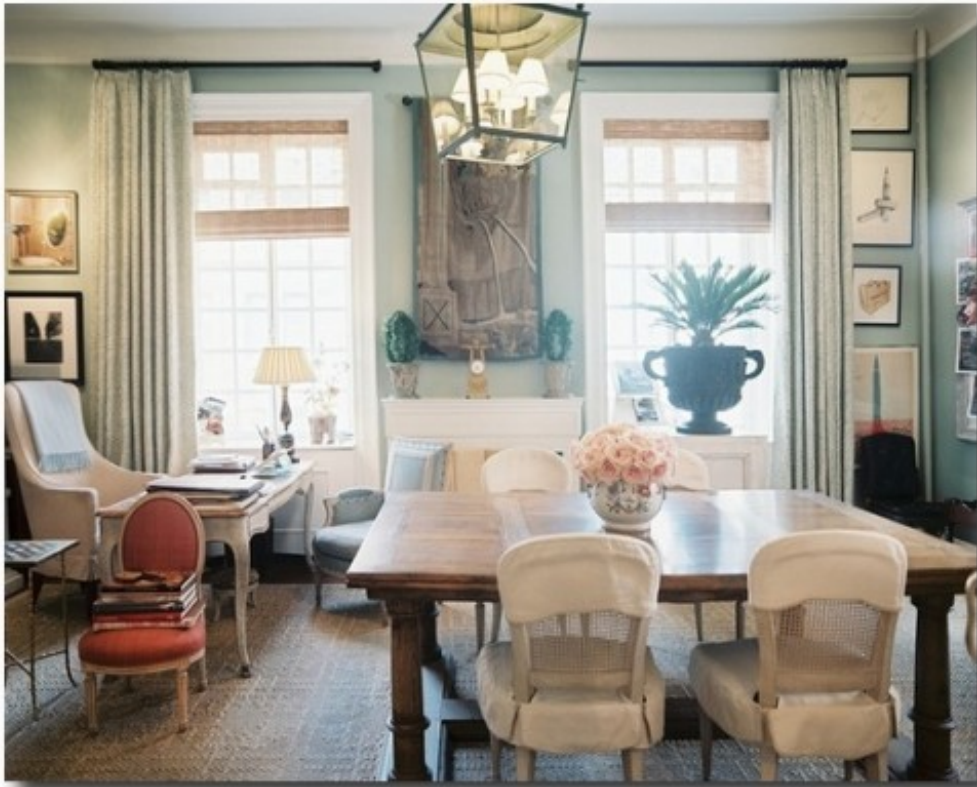
French Dining Room Chairs With Slipcovered Seats and Backs