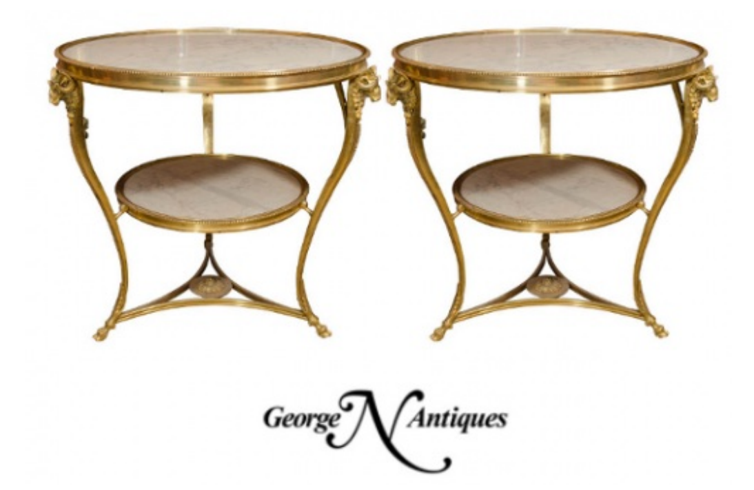
Pair of Louis XVI Style Gueridons -George N Antiques