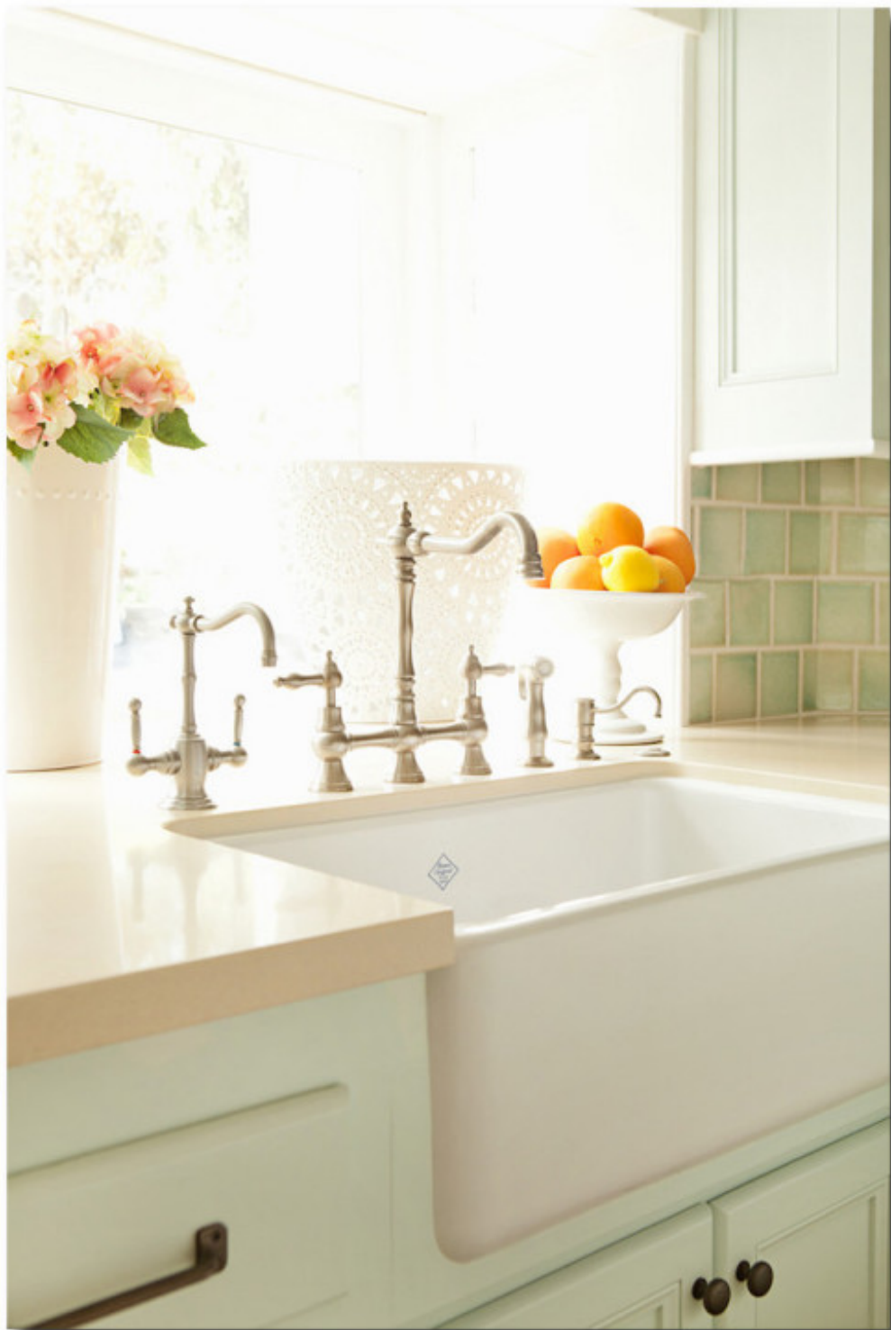
Interior Designer Brende Home Interior Design