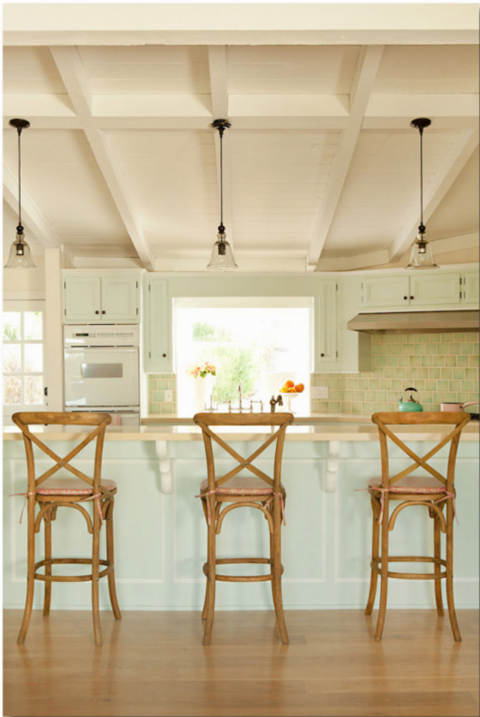
Interior Designer Brende Home Interior Design