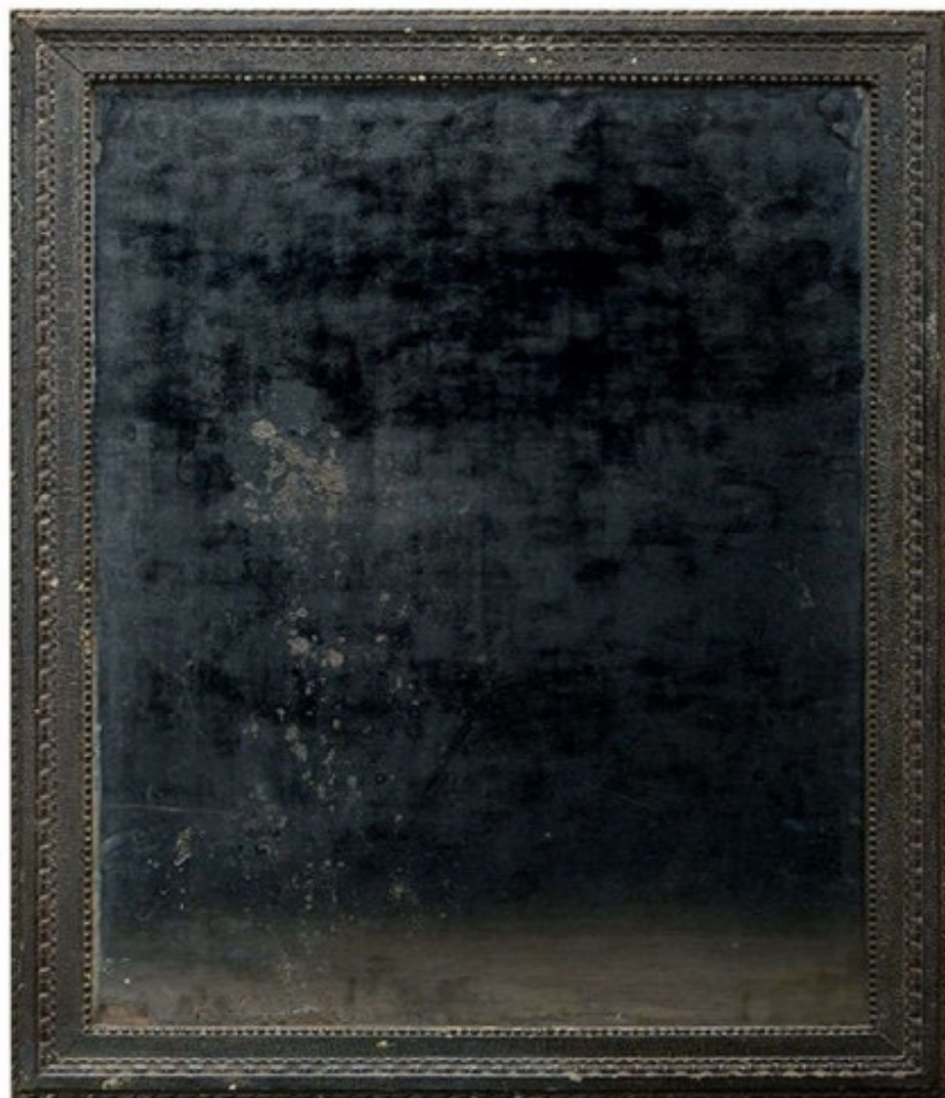
French Carved Original Black Painted Mirror Mecox Gardens