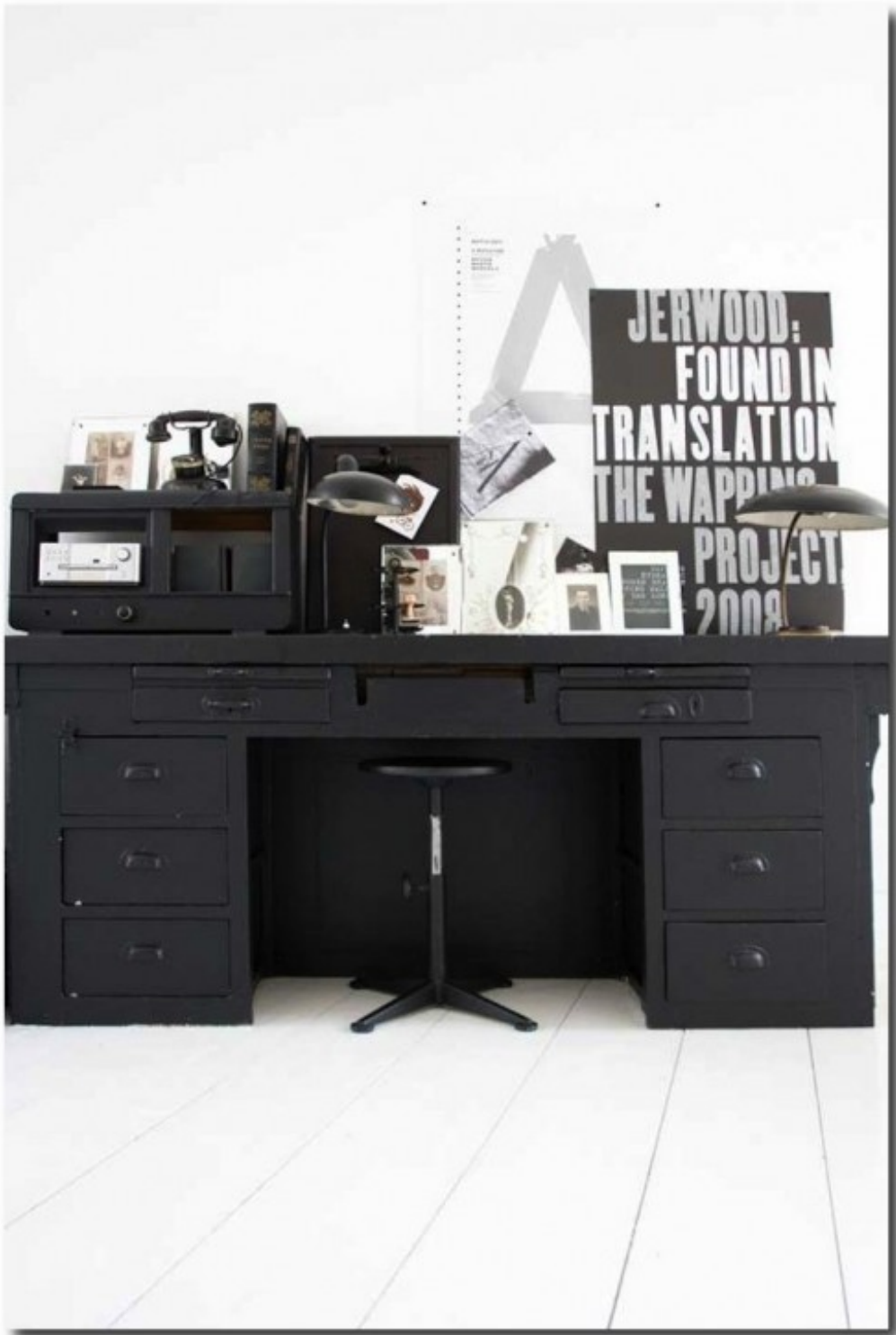
A black-painted desk at Sleep in the City in Antwerp.