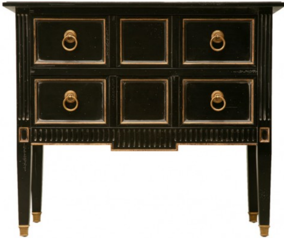
French Louis XVI Style Commode w/ Pink Interior Antiques on Old Plank Road