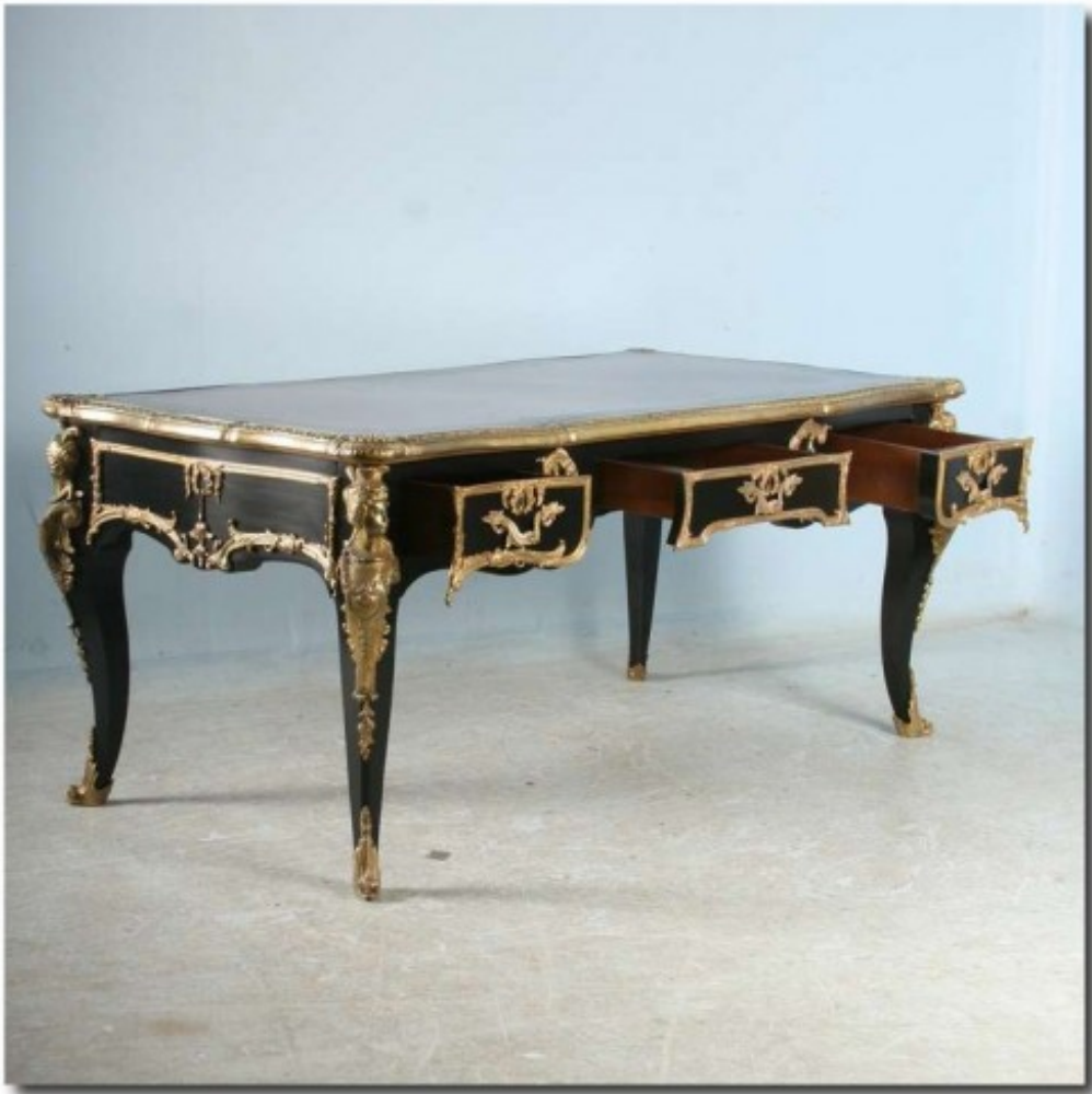
Antique French Desk Bureau Plat with Black Paint -Scandinavian Antiques