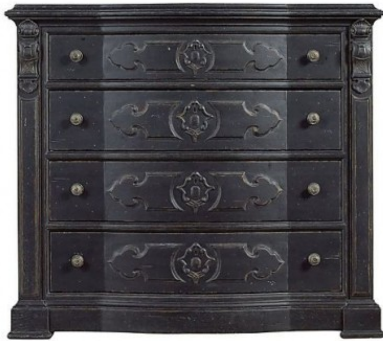
Epoque 4-Drawer Dresser on OneKingsLane.com