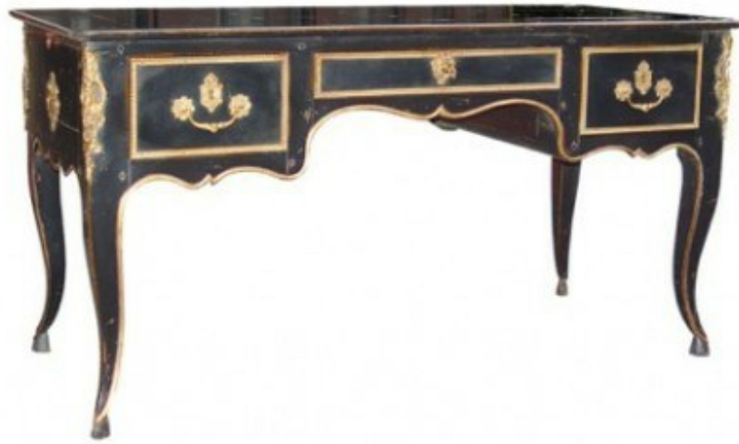
Cote France Desks Hand Painted Black Wood with Gold Trim and Brass Hardware Details Manufactured by Moissonnier