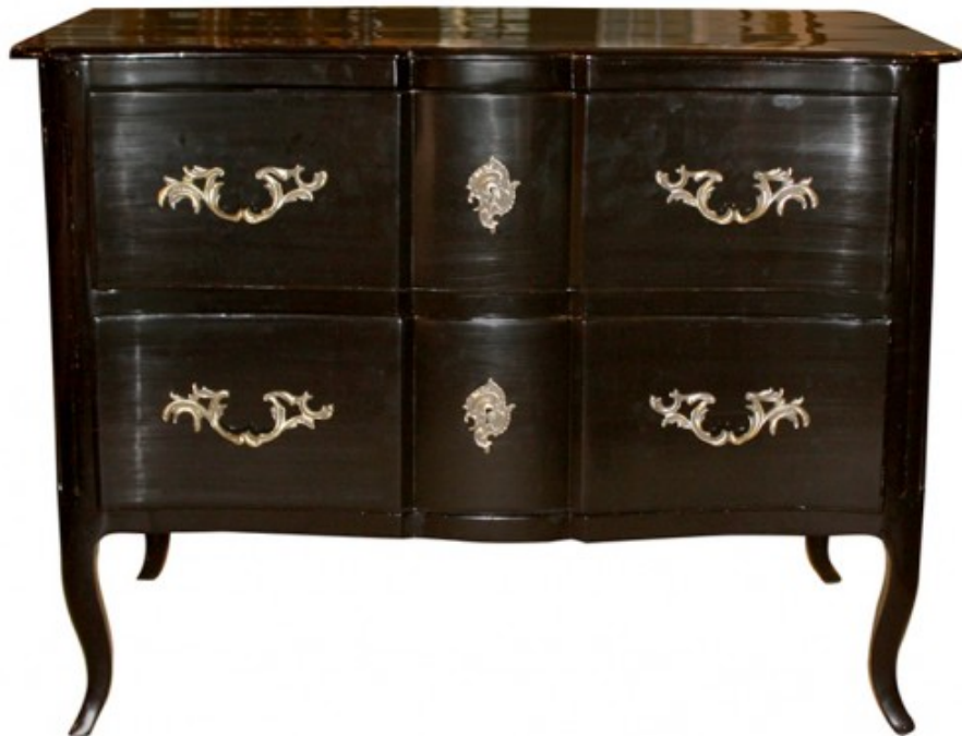
18th Century French Louis XV Black Lacquer Commode Bermingham and Co