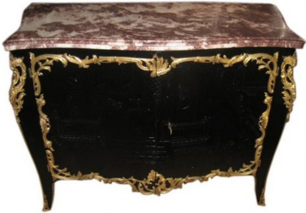
French Black Lacquered Chinoiserie Marble Top Commode – Ceylon Et Cie