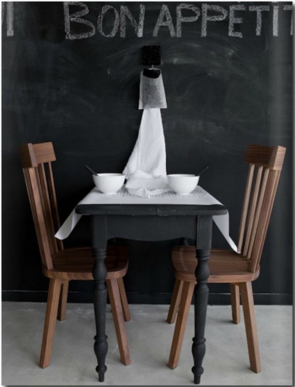
A chalkboard black-painted table.