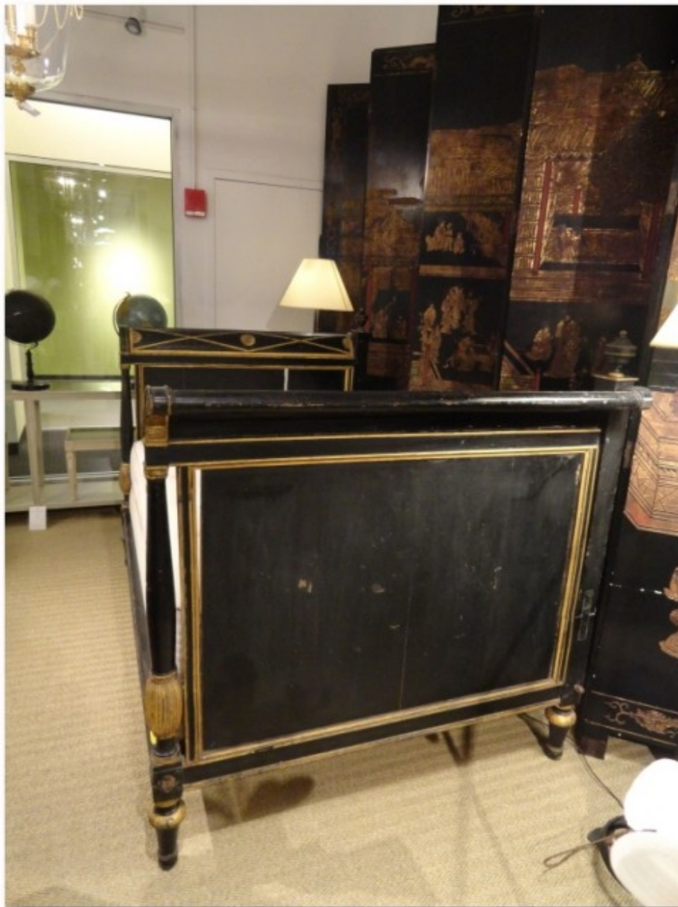
A period Directoire paint & gilt daybed with flared sides and decorative gilt accents in the Neoclassical style. Original paint and gilding Charles Spada Antiques