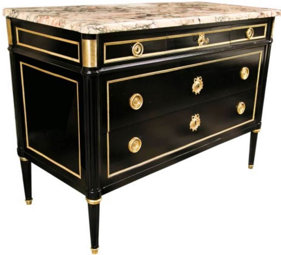
French Louis XVI reproduction Commode in Style of Maison Jansen. G4 Decor, LLC