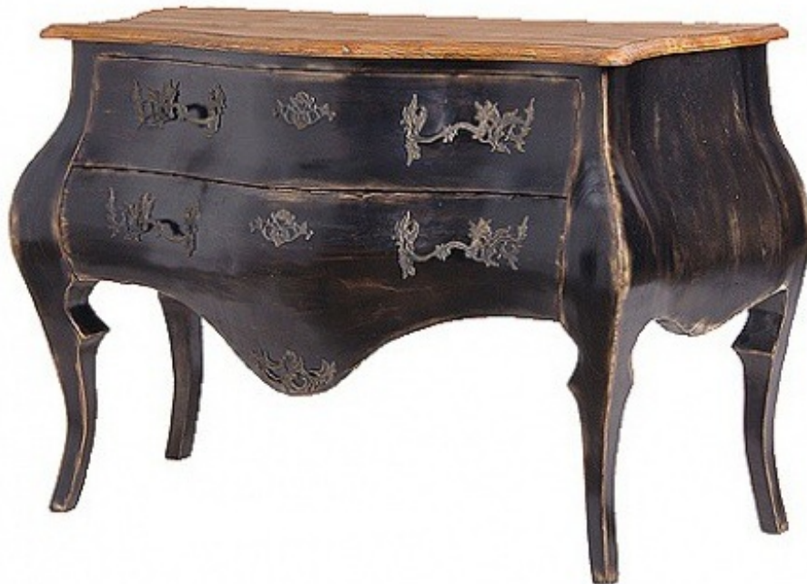
French Provincial Styled Buffet From Arte Fina Furniture