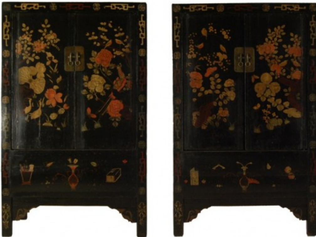
Pair of 19th Century Chinese Black Lacquer Cabinet with Wucai Painting -Pagoda Red