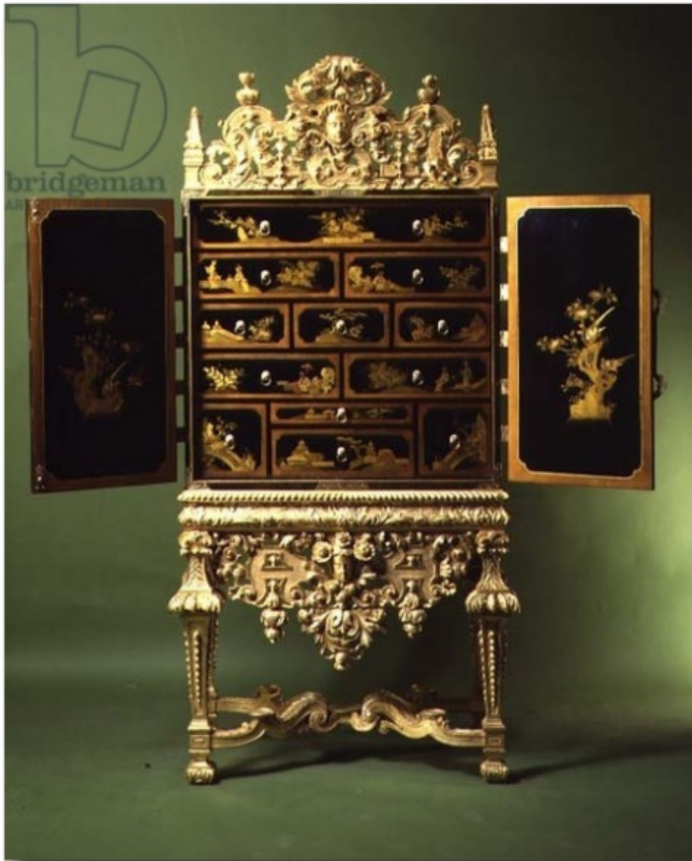
Chinese export lacquer cabinet and stand of gilt gesso in the French style, English, 17th century (lacquer and gilt gesso)