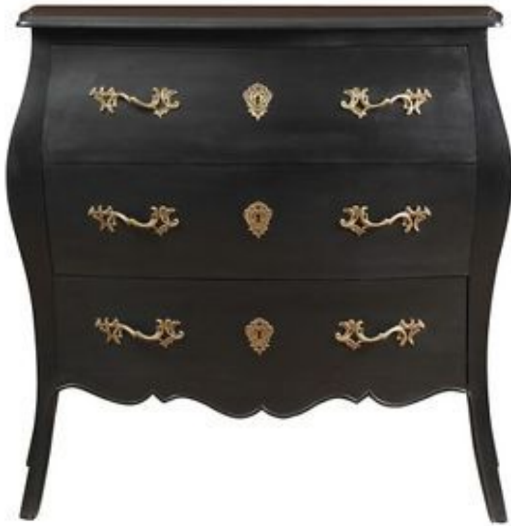
French Black Painted Furniture Visit ebay.co.uk