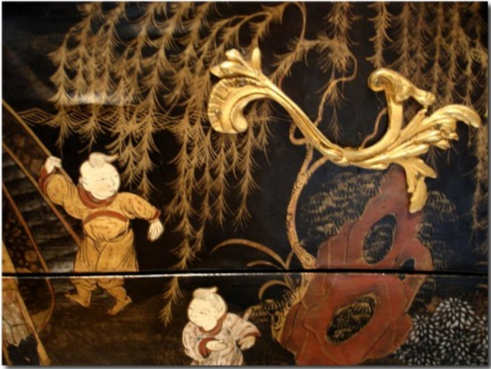
French Louis XV Style Black Lacquer Commode -Alexander Westerhoff Antiques