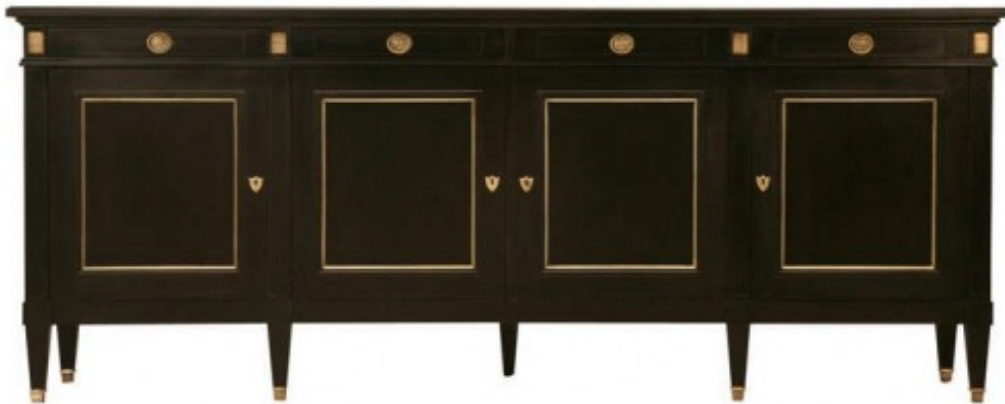
Ebonized Vintage French Directoire Style 4 Drawer over 4 door Buffet