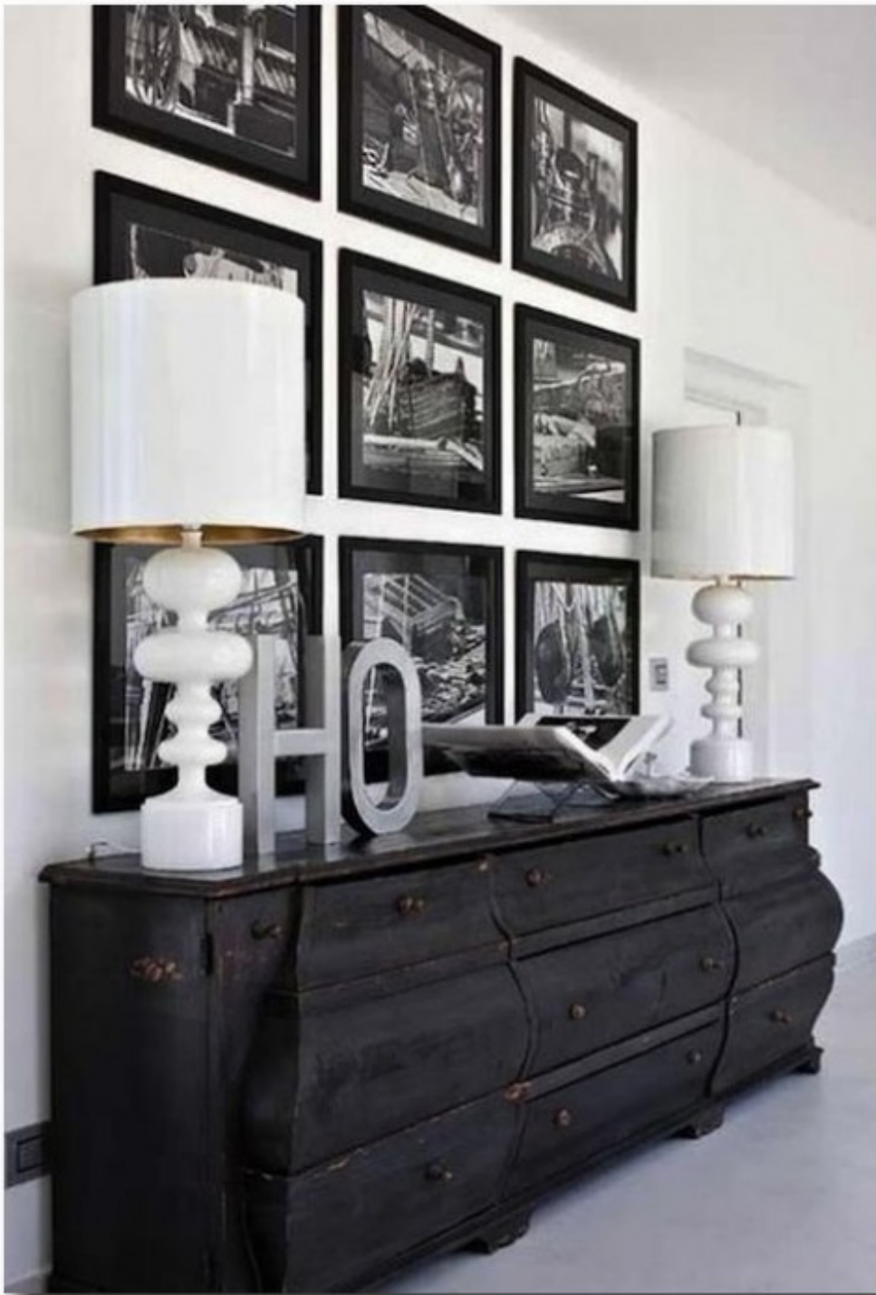
A sideboard from the Contemporary Living Handbook 2012-2013 (Beta-Plus Publishing), via Belgian Pearls .