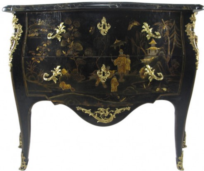
A Louis XV Gilt Bronze Mounted Black Lacquer Chinoiserie Commode- Glen Dooley Antiques