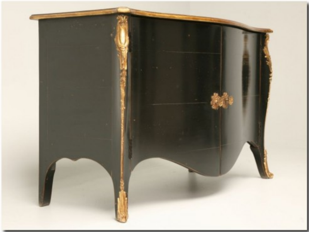
French Handmade Black Lacquered Buffet -Antiques on Old Plank Road