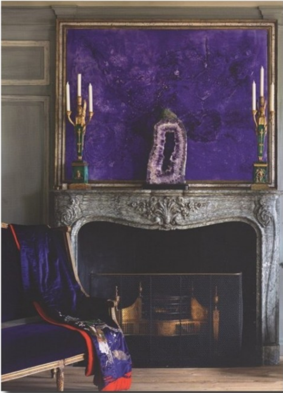
French Interiors Decorated Around Purples- monreveandco.blogspot.com