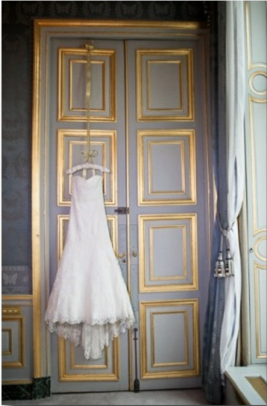
Wedding in Paris Photographer in Paris