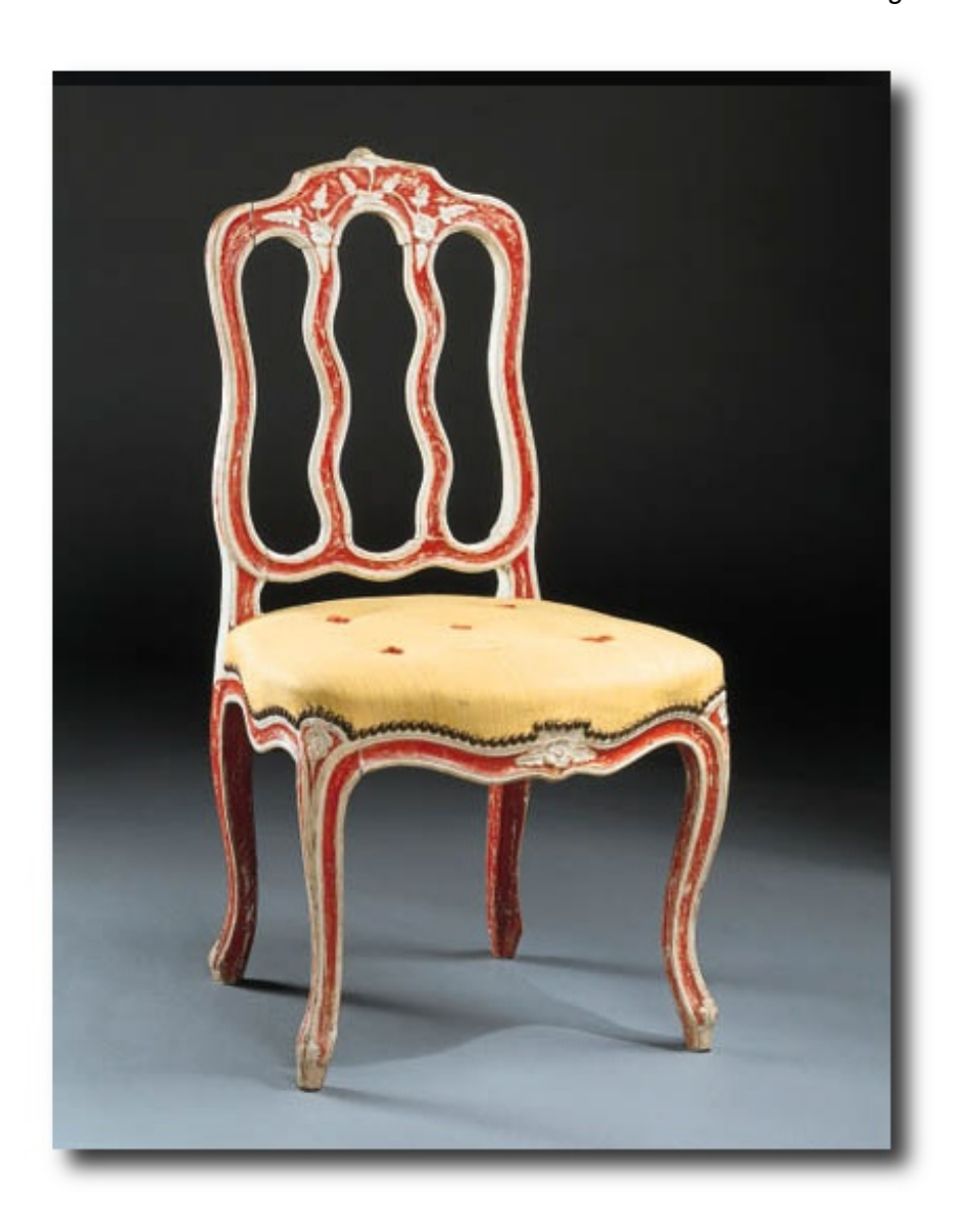
A Louis XV Red Chair with Cream Painted Accents