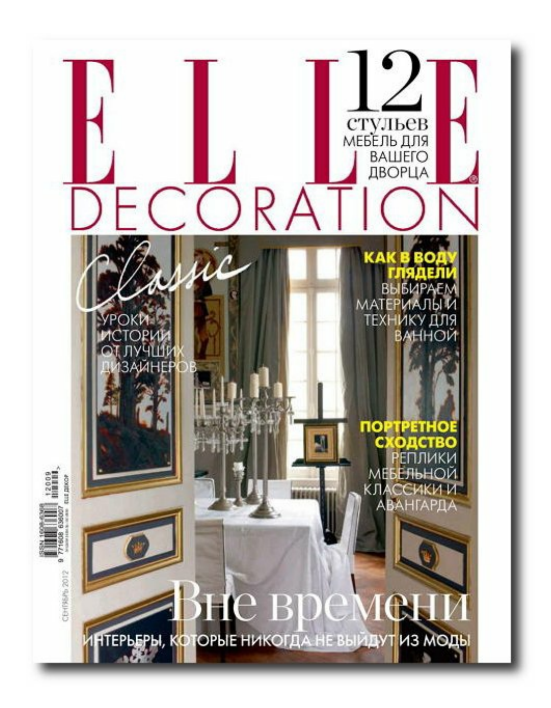
Elle Decoration Russia showing painted doors with navy detail on white.