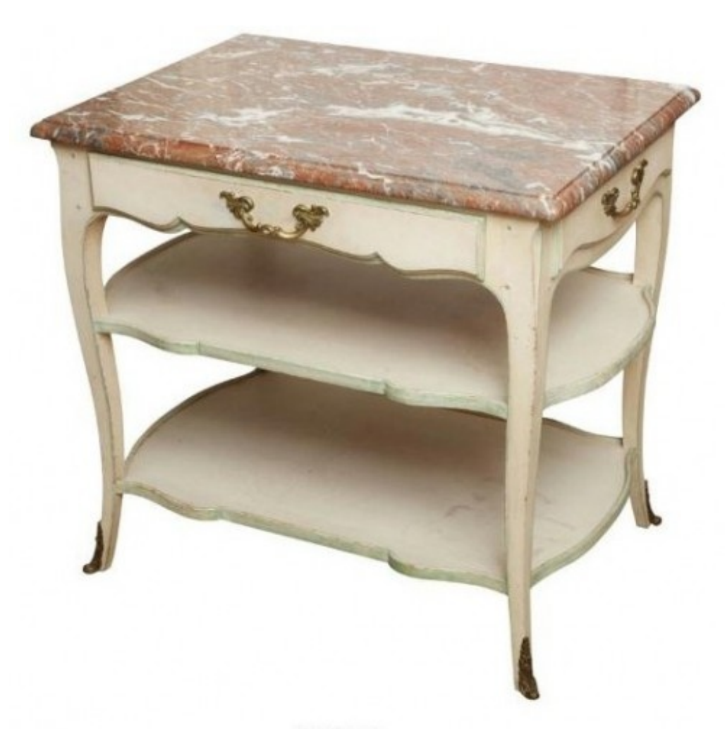
TODD ALEXANDER ROMANO, LLC