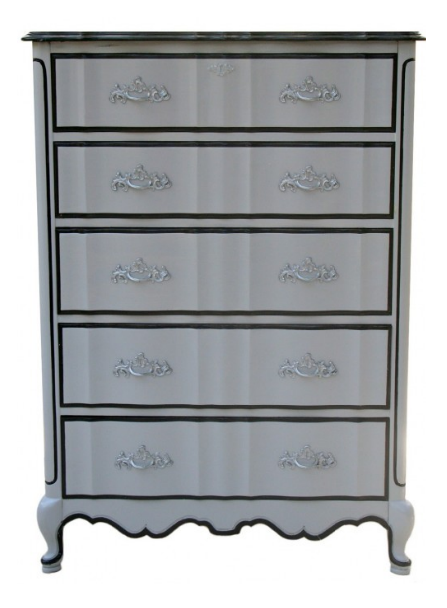
A French Provincial Chest Painted In A soft blue-gray with black details From Tracy's Fancy on esty Look at my favorites from Tracy's Paintings on Our French Decorating Group On Facebook