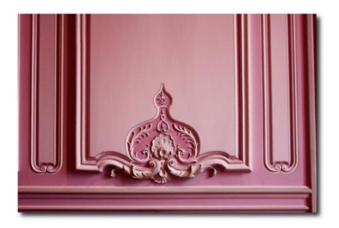
Pink Detail Painted Boiserie Seen at the Carnavalet Museum