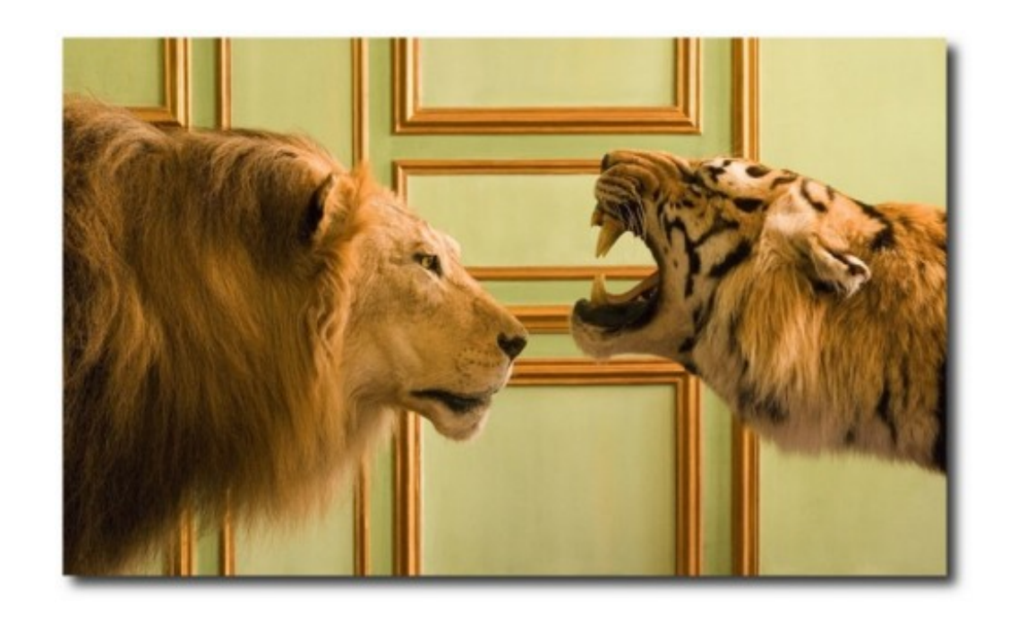
Here we see two shades of green, accented with gold. Taken At Deyrolle In Paris