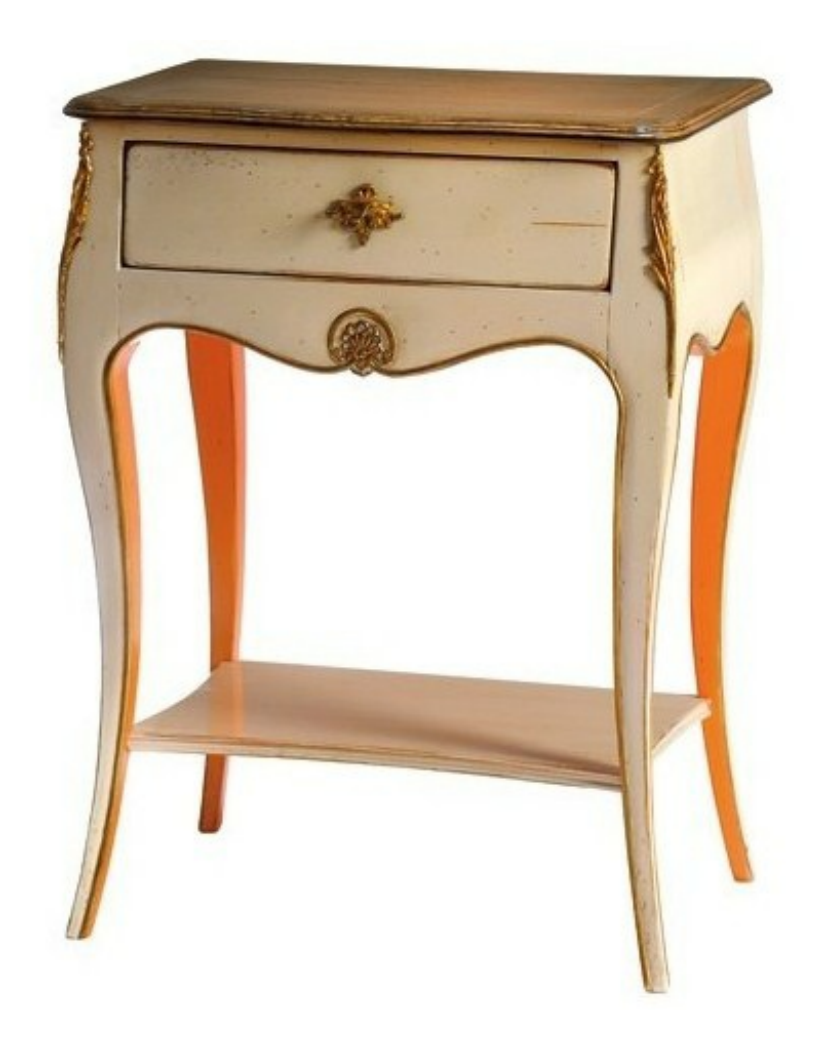
French Side Table Painted In White With A Touch Of Orange