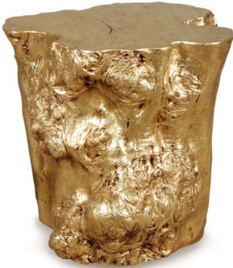
Gold Leaf Log Side Table - wanelo.com