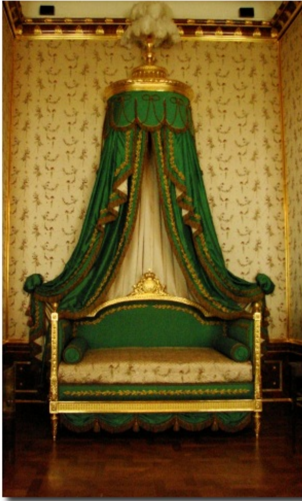
Luxury Gold Furniture- Achieve This Look With Gold Leaf