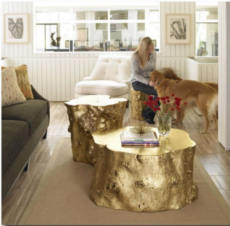
Gold Leaf Log Tables HGTV