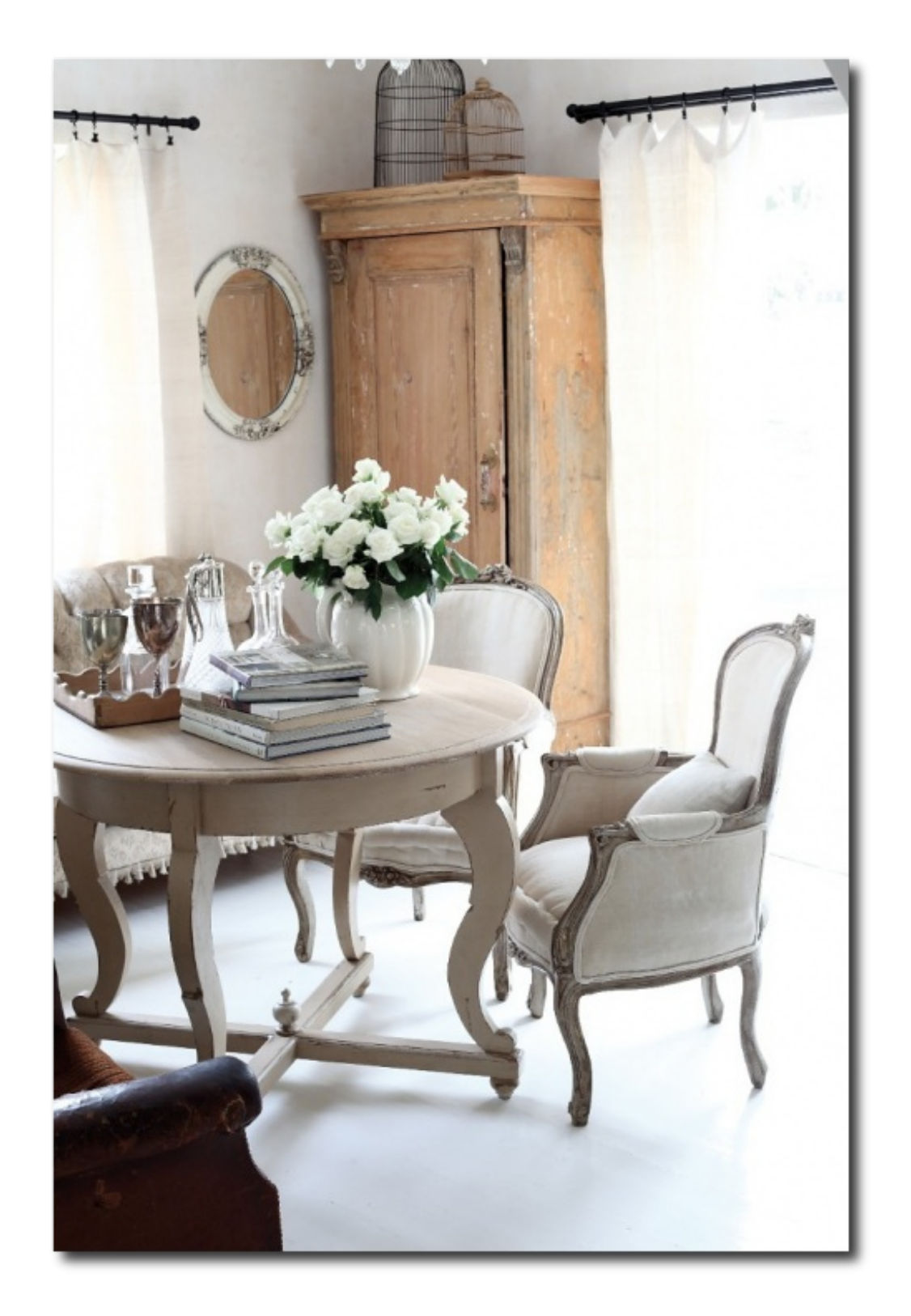
Home in South Africa Decorated Around Whites