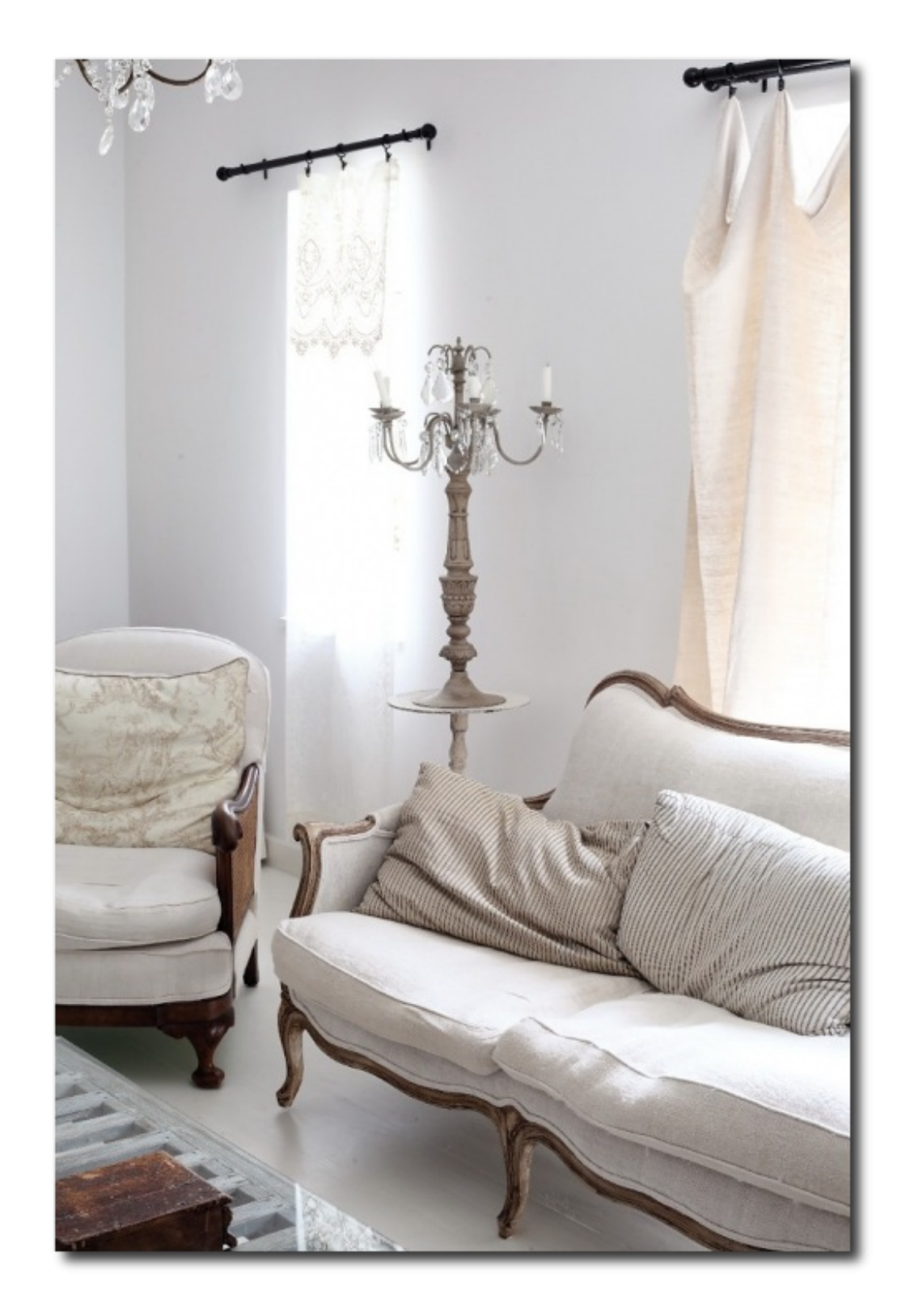
Home in South Africa Decorated Around Whites