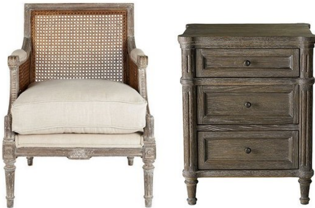
Curations Limited Alden Weathered Oak 3-Drawer Nightstand, Louis XVI Chair -Wisteria