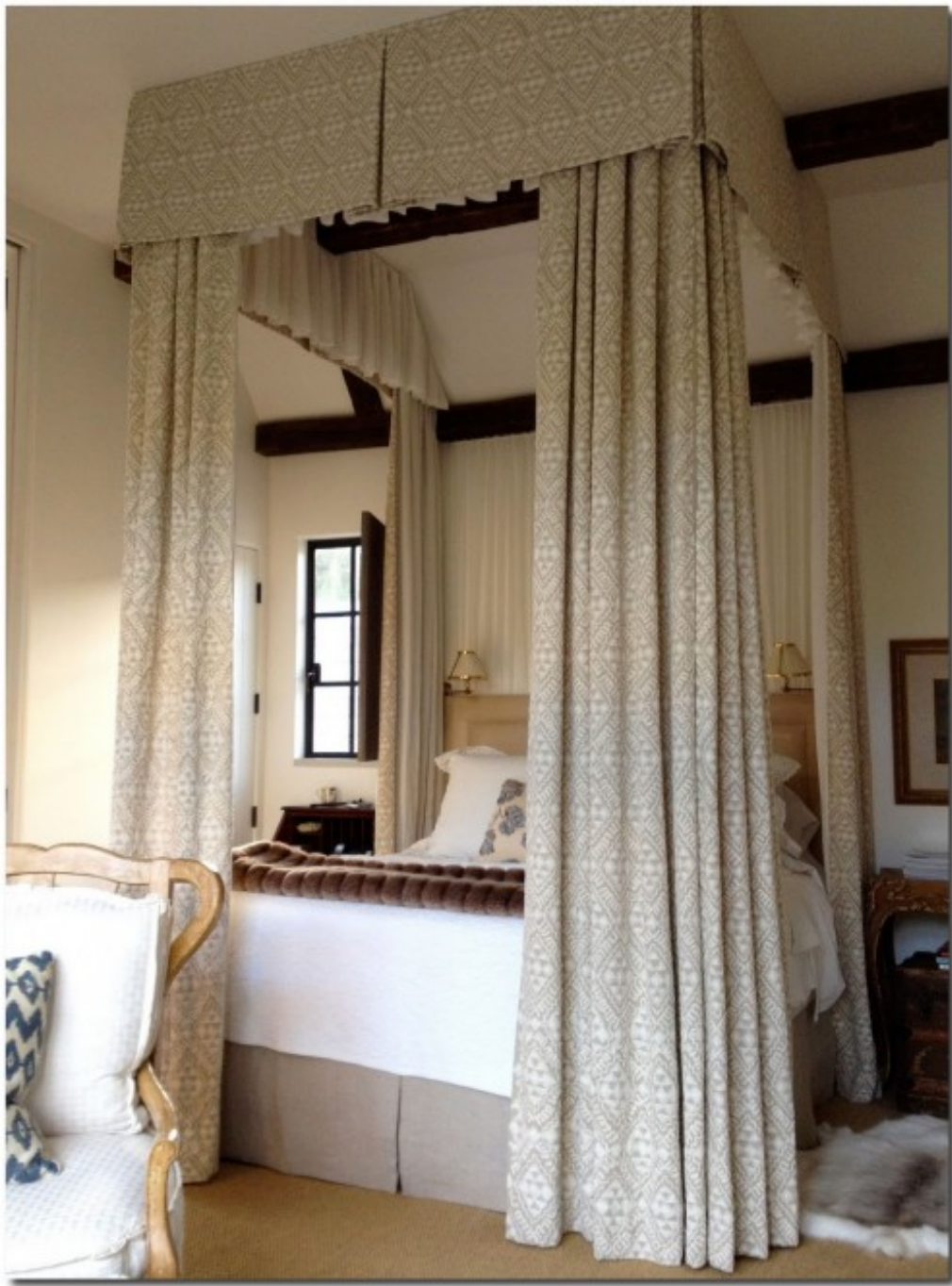
Rela Gleason Design,