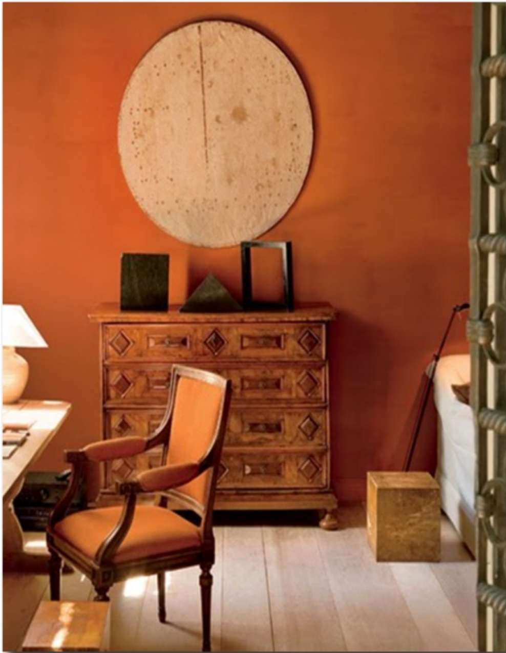
The flat in Venetian Palazzo owned by Belgian designer Axel Vervoordt