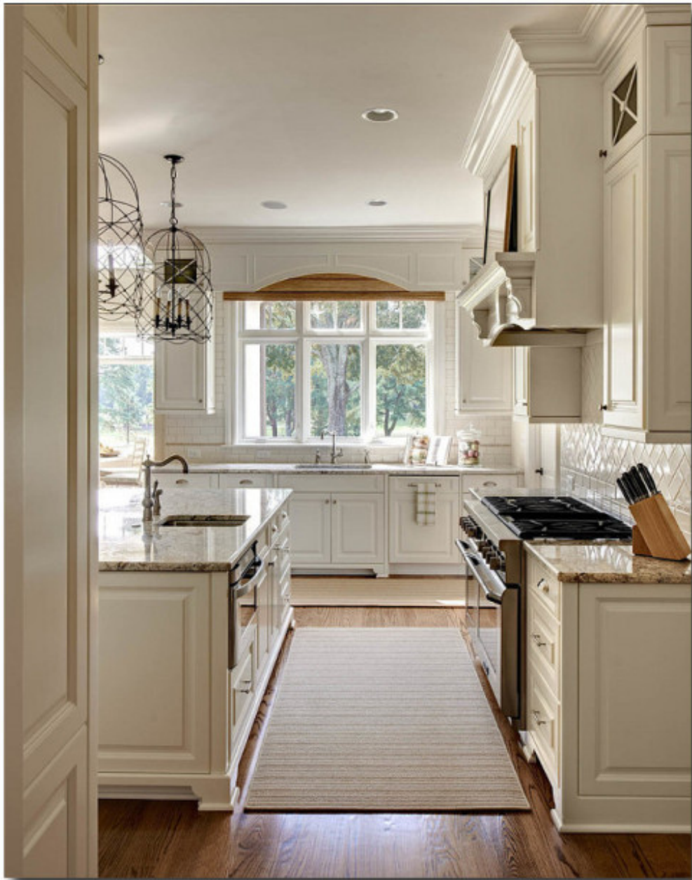
Distinctive Cabinets, LLC