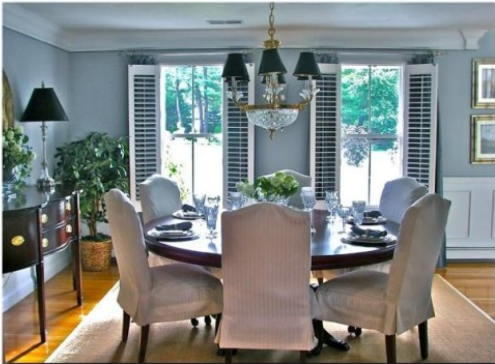
Winter Solstice - Benjamin Moore & Co