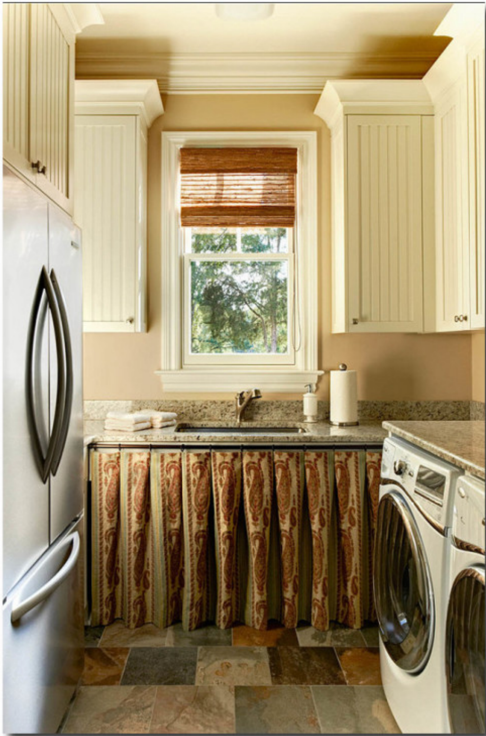
Distinctive Cabinets, LLC