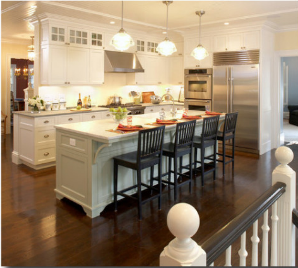
Boston LDA Architects