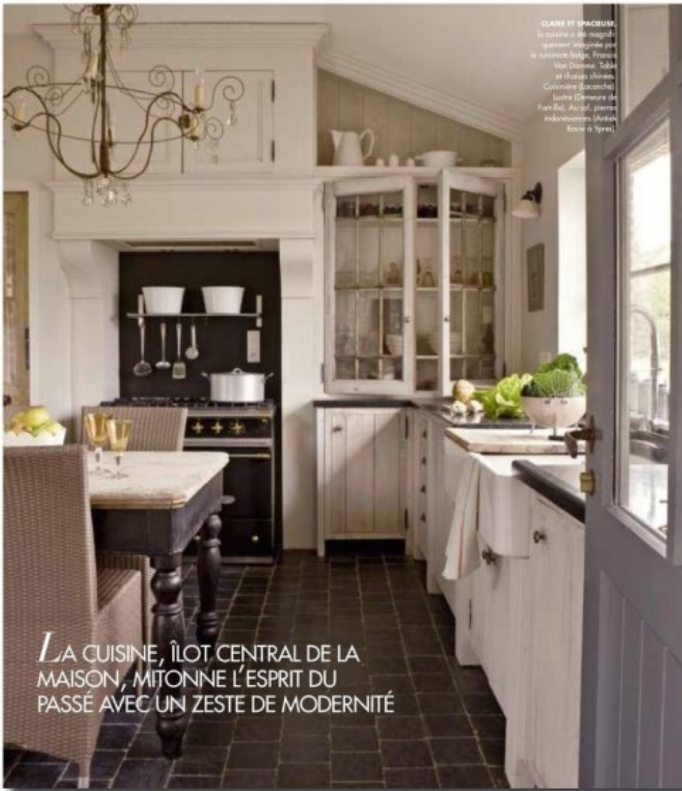
Magazine Campagne & Décoration