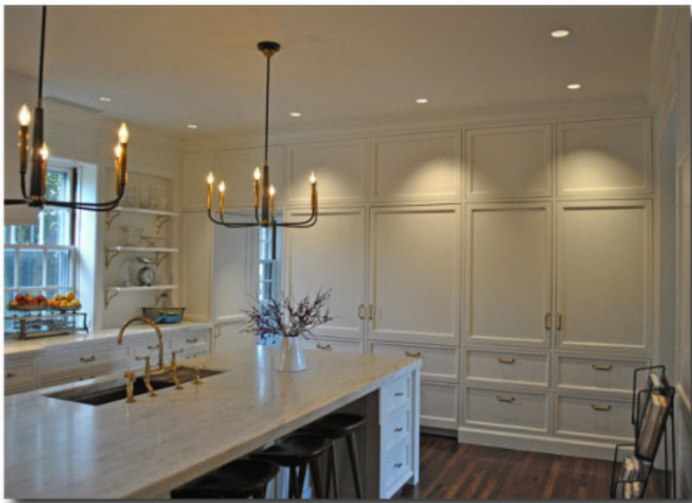
Huestis Tucker Architects, LLC ...