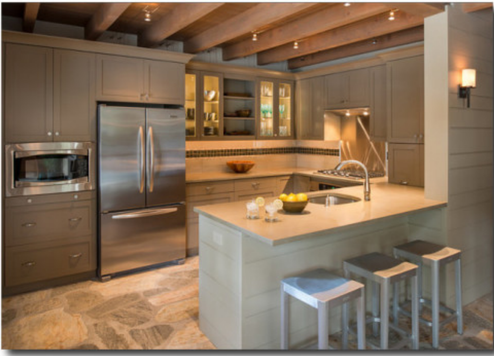
Archer & Buchanan Architecture, LTD