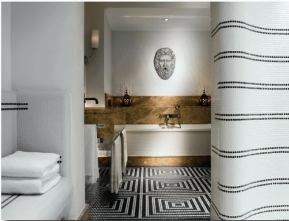
De Russie Hotel Rome