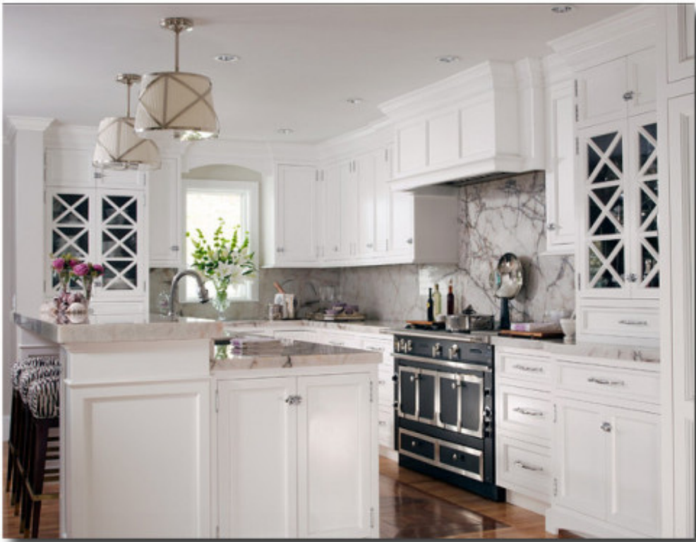
Signature Kitchen & Design, Inc