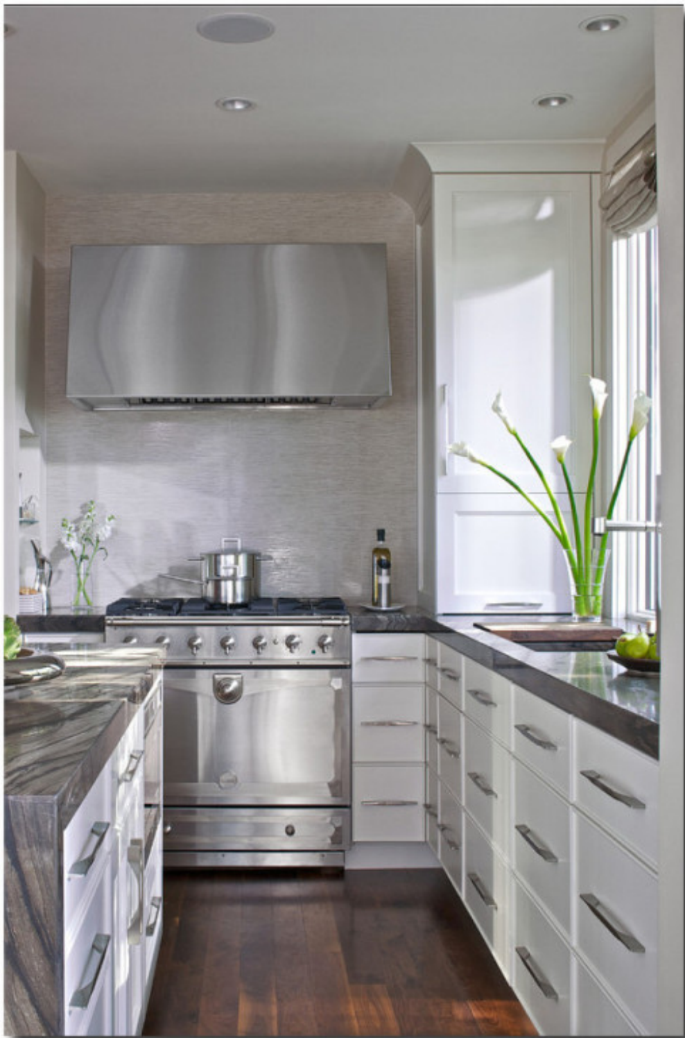
Signature Kitchen & Design, Inc