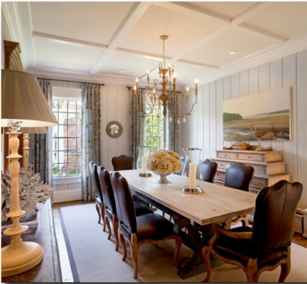
Amanda Webster Design, Inc.