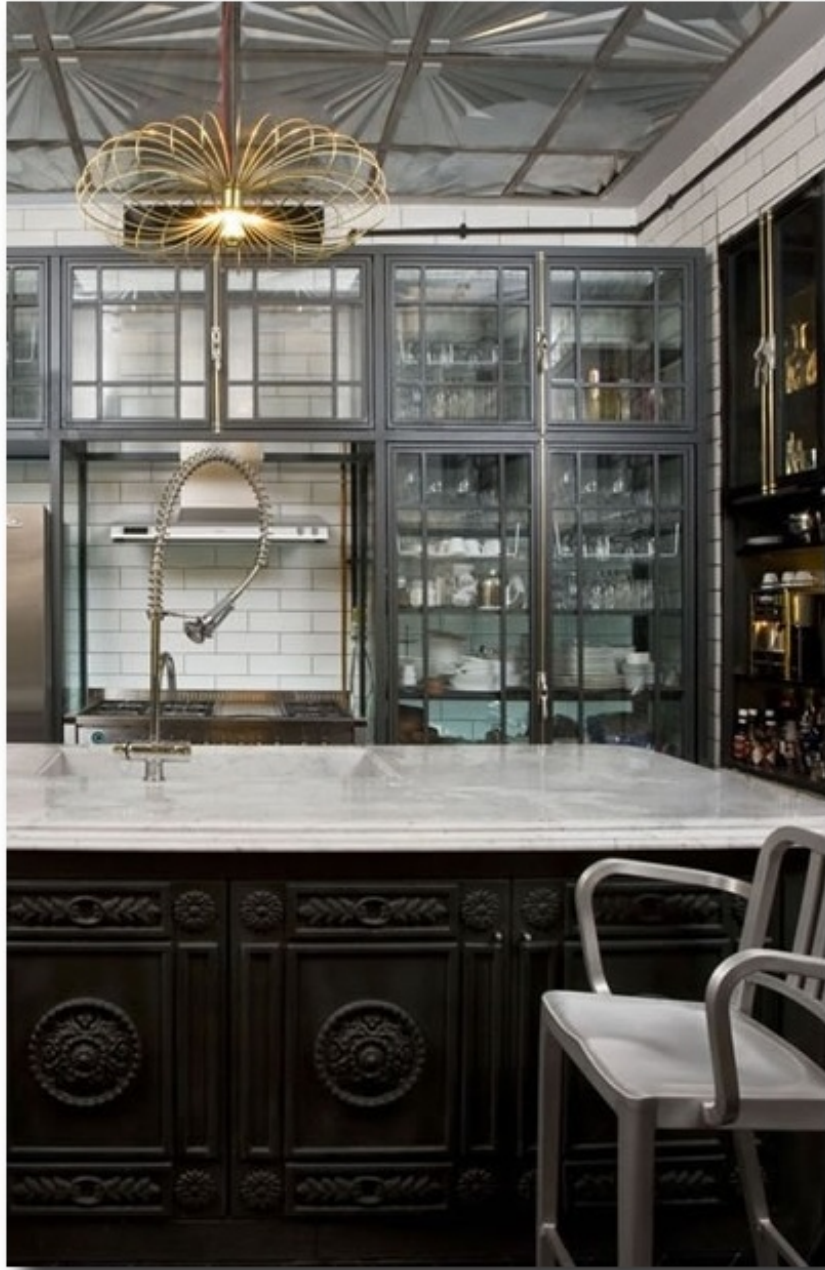
The House Cafe - Tünel in Istanbul by Autobahn