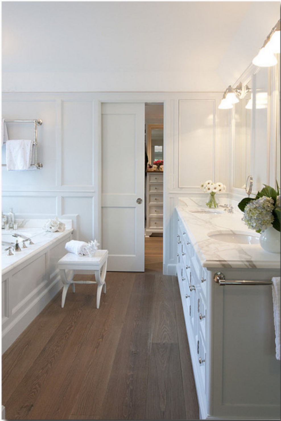
Julie Nightingale Design