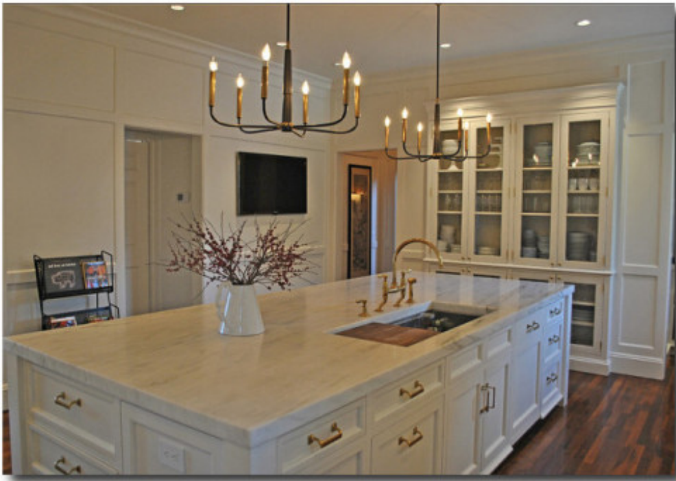
Huestis Tucker Architects, LLC ...