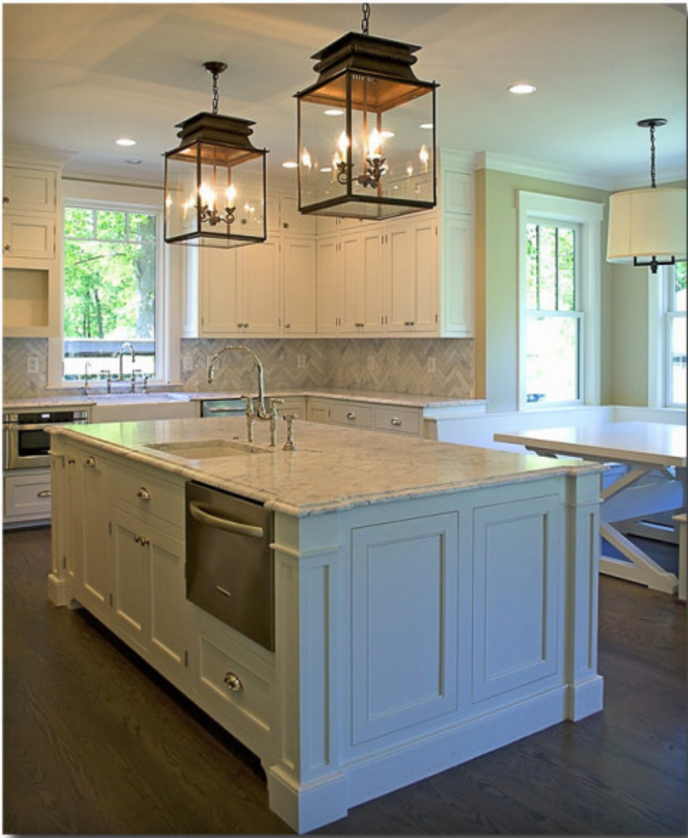
Designed by Old River Cabinets