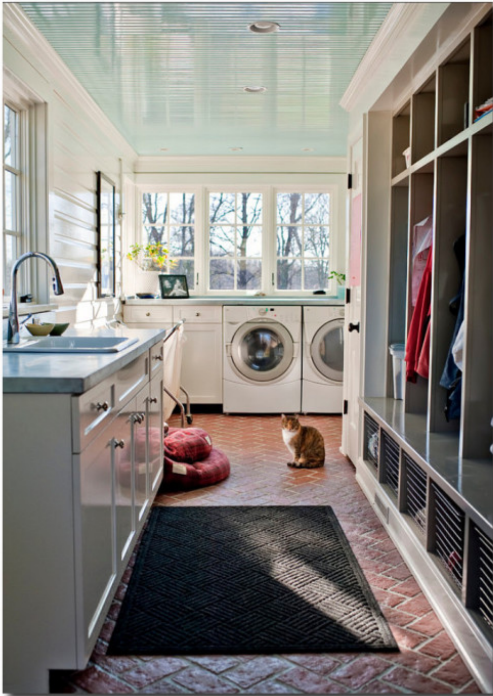
Designed by Rock Paper Hammer