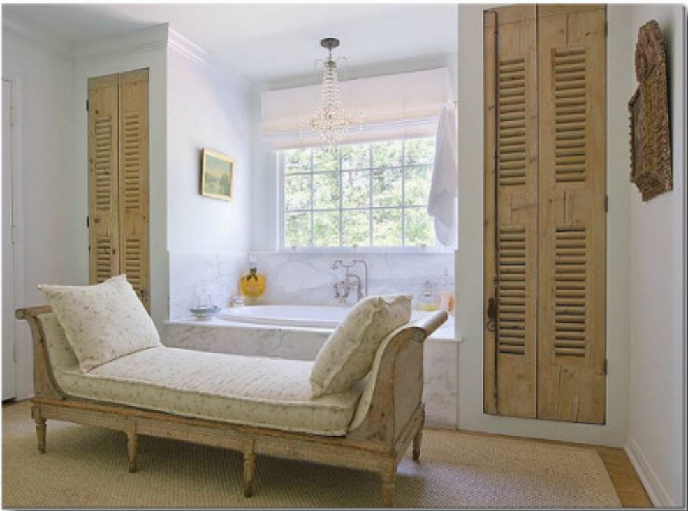
Designed by Carol Glasser Interiors