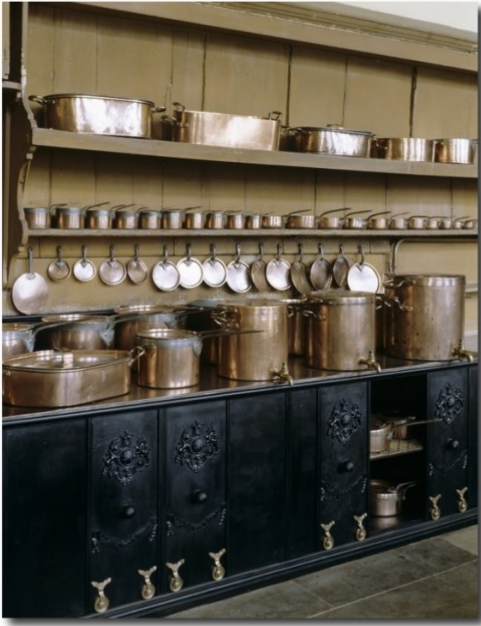
Discover Petworth | South Downs, West Sussex