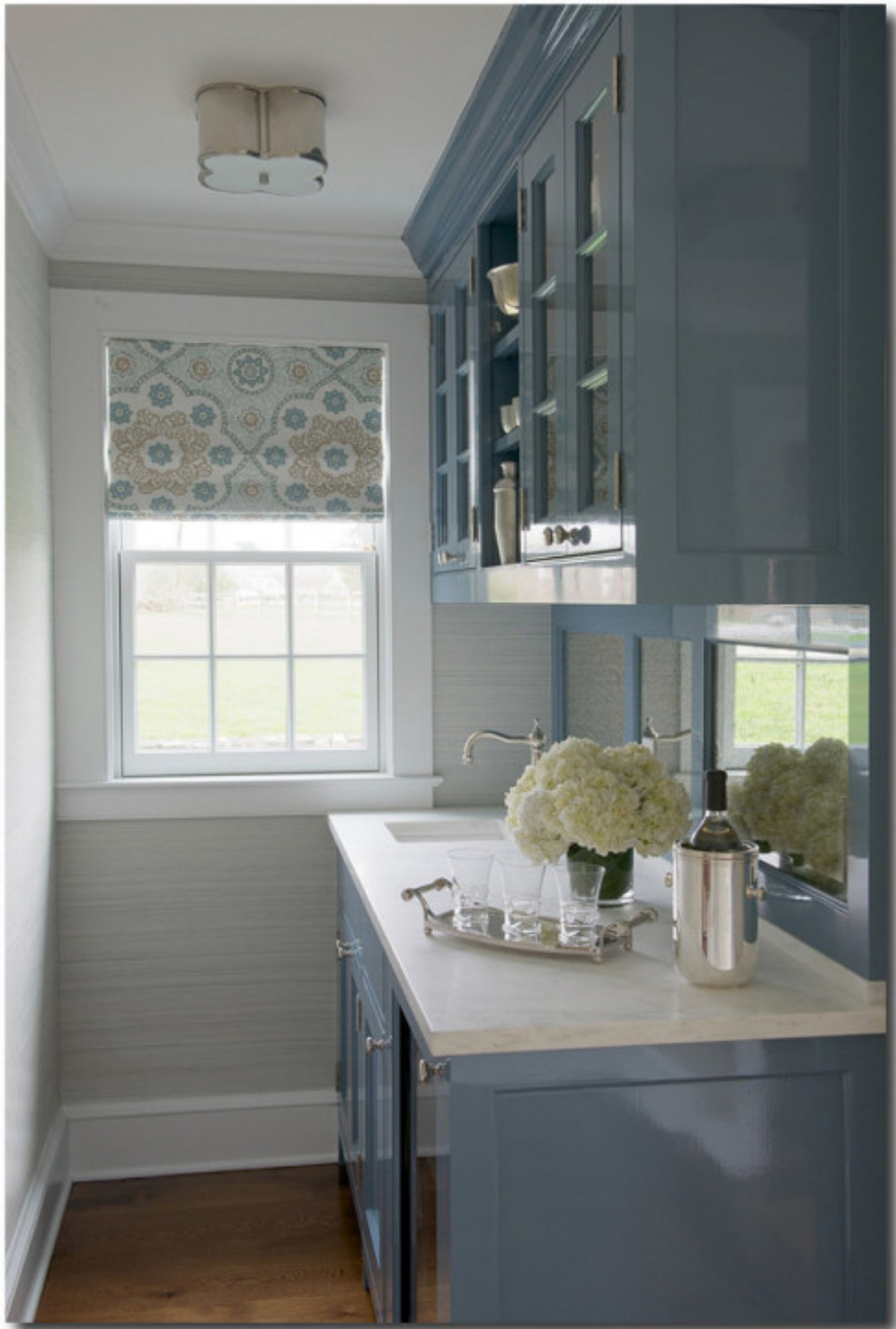
Designed by Kerry Hanson Design