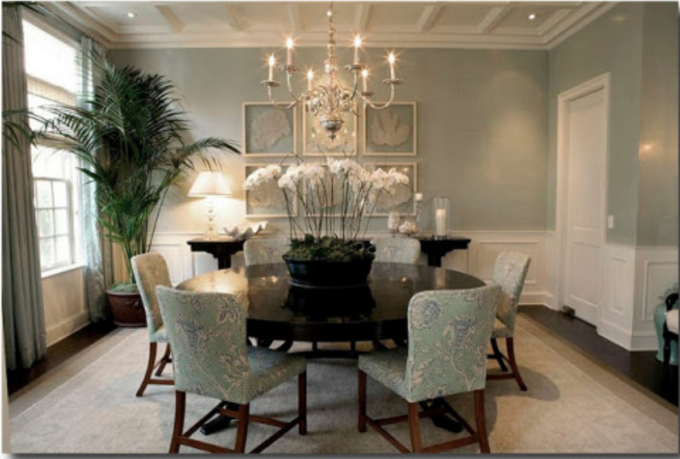
Berman House (color is similar to Aganthus Green by Benjamin Moore)