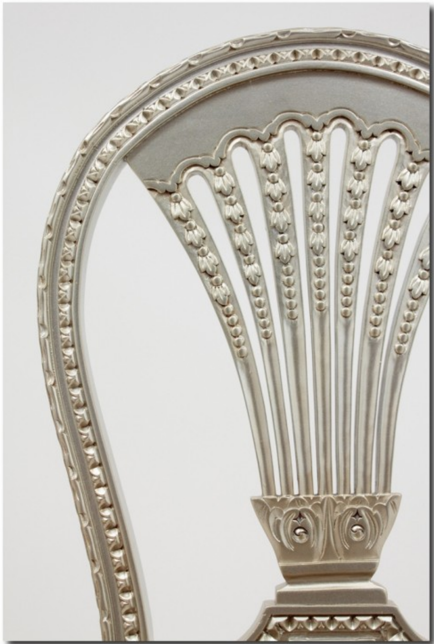
Best Pictures From Laurel Crown- Seen On Flickr