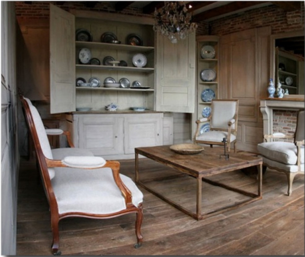
The Belgian Style