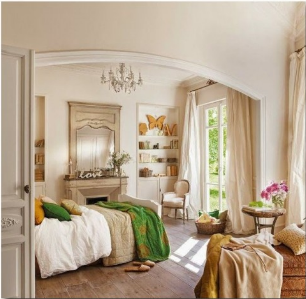
Distressed Interiors