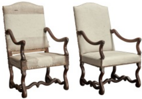
Pair of Tall Back Armchairs