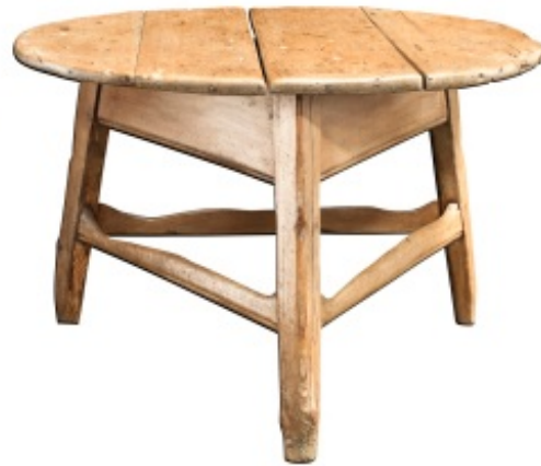
Large Cricket Table with Natural Legs Top