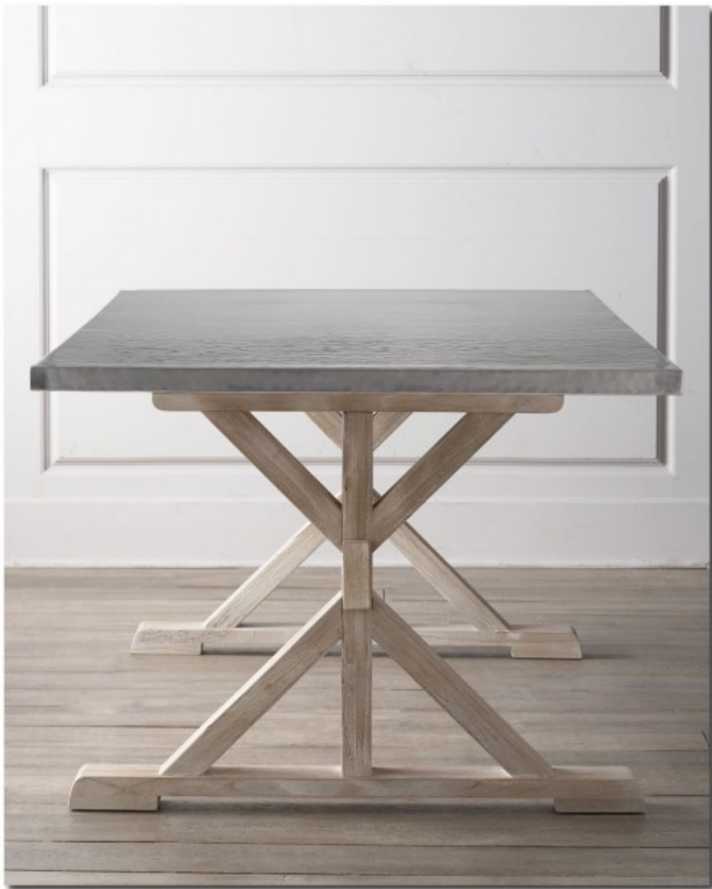
Fowler Dining Table - $1,499.00 here