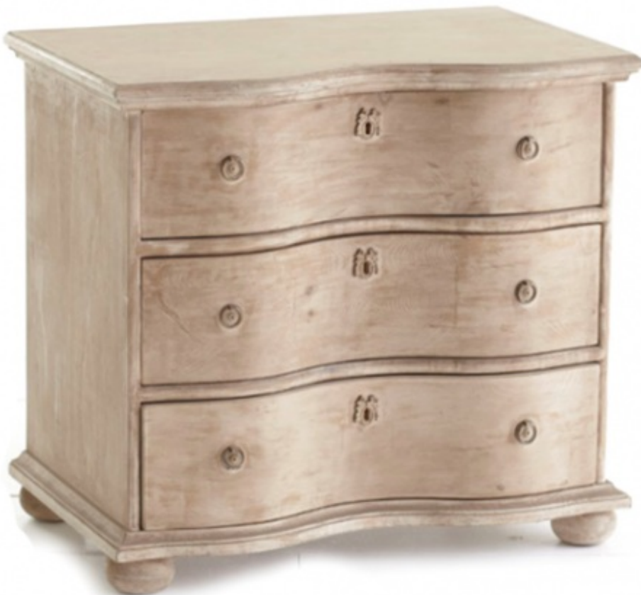
Dutch Chest Of Drawers From Wisteria