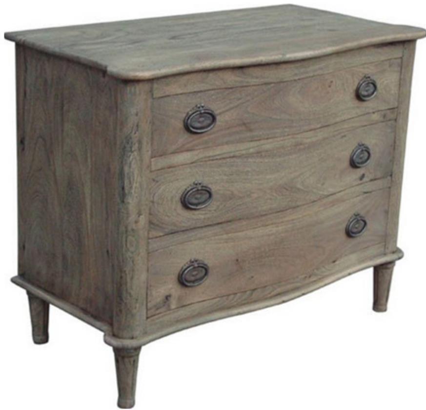
Wooden Wardrobe