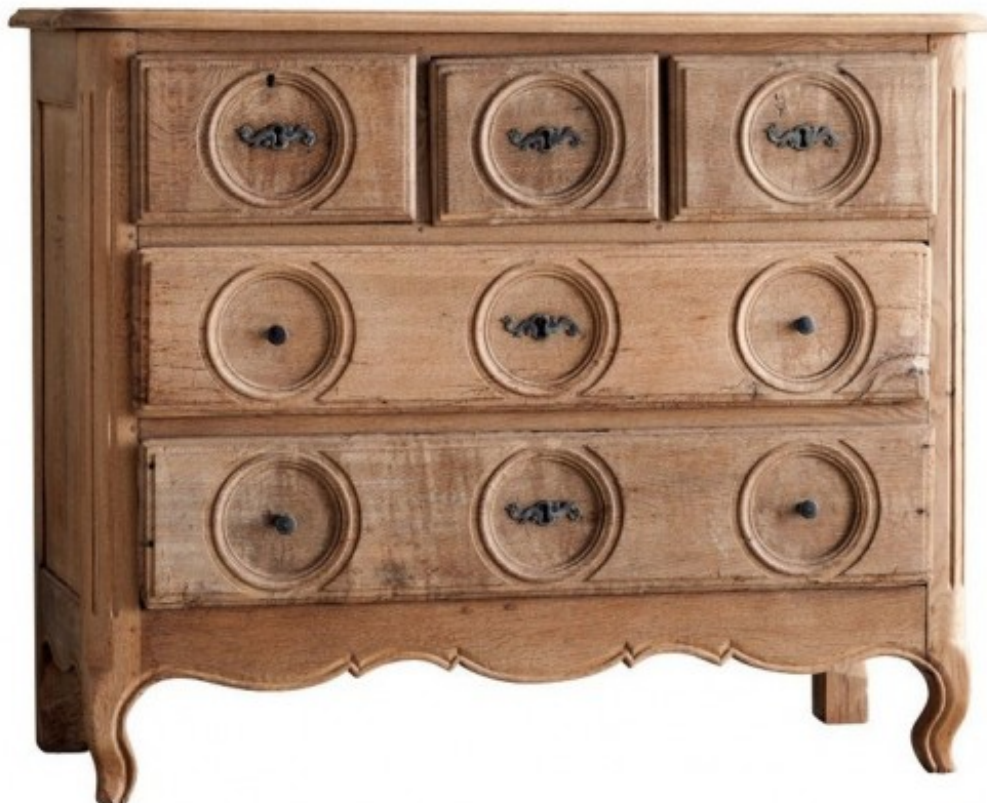
Raw Wood Chest From Red Ticking