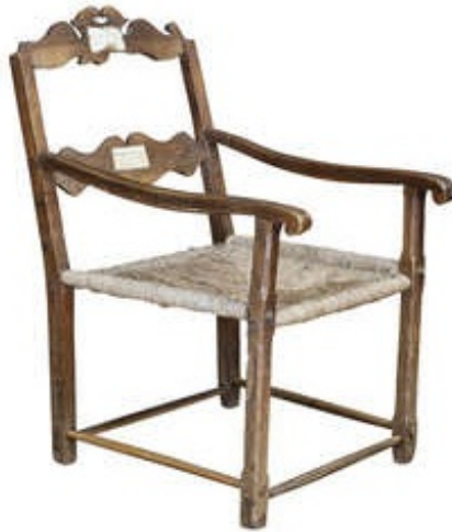
Oversized Farm Chair