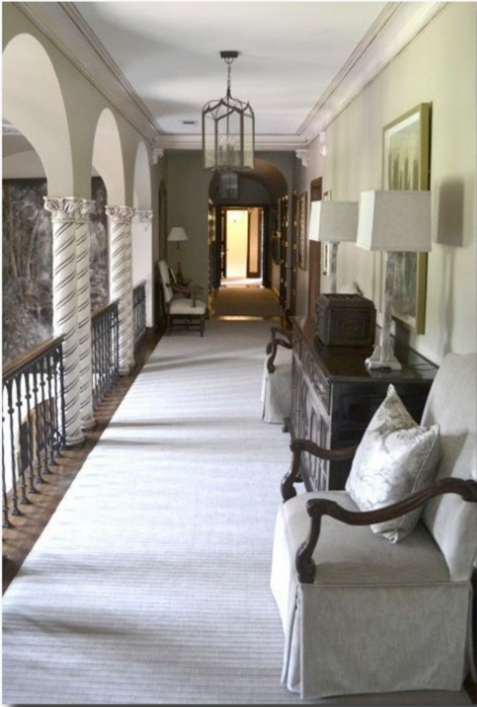
Dana Wolter Interiors, danawolterinteriors.com