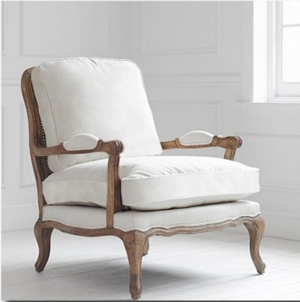
Armchair From Nordic Style