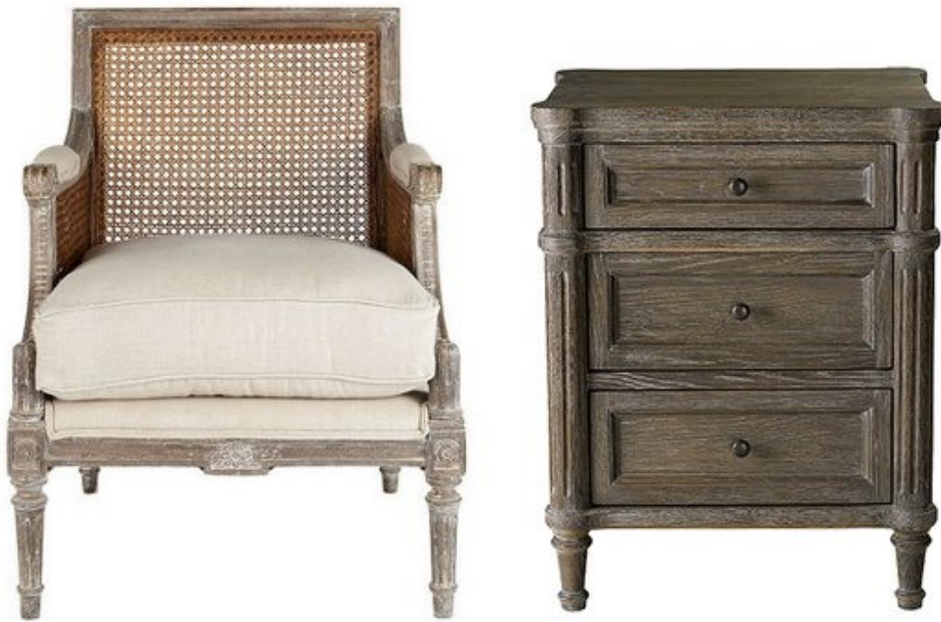
Curations Limited Alden Weathered Oak 3-Drawer Nightstand, Louis XVI Chair -Wisteria