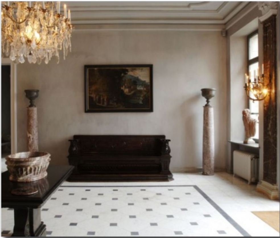
The Belgian Style