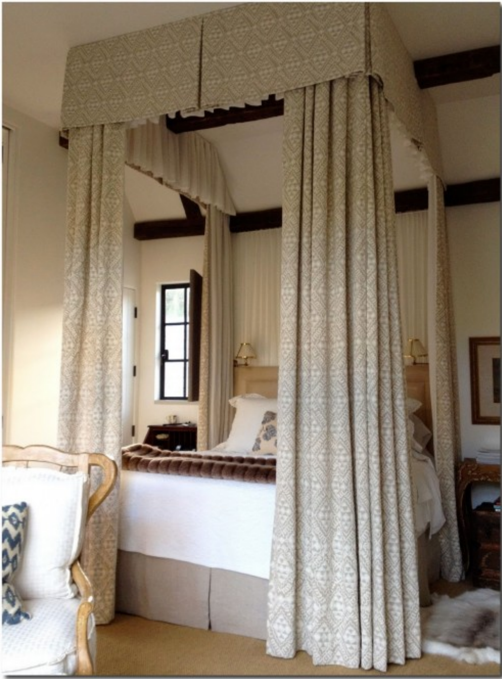
Rela Gleason Design,