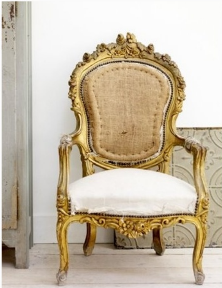
Italian Distressed Chair In Burlap and Gilt Wood- Unknown Designer