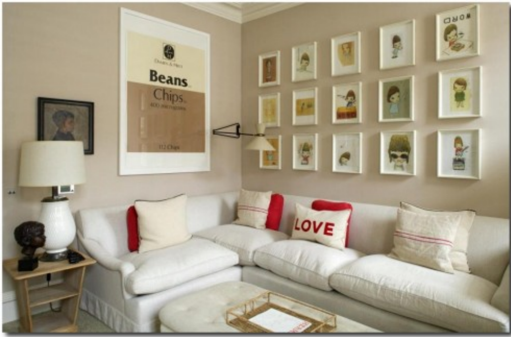
Annabels House White Decorating Ideas 1st-option.com