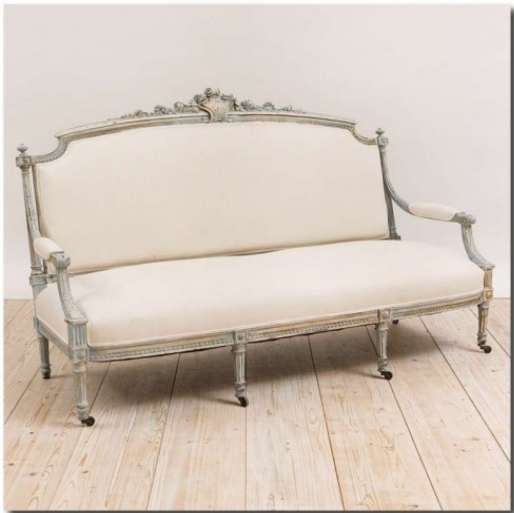
French Louis XVI Style Upholstered Sofa in Painted Finish