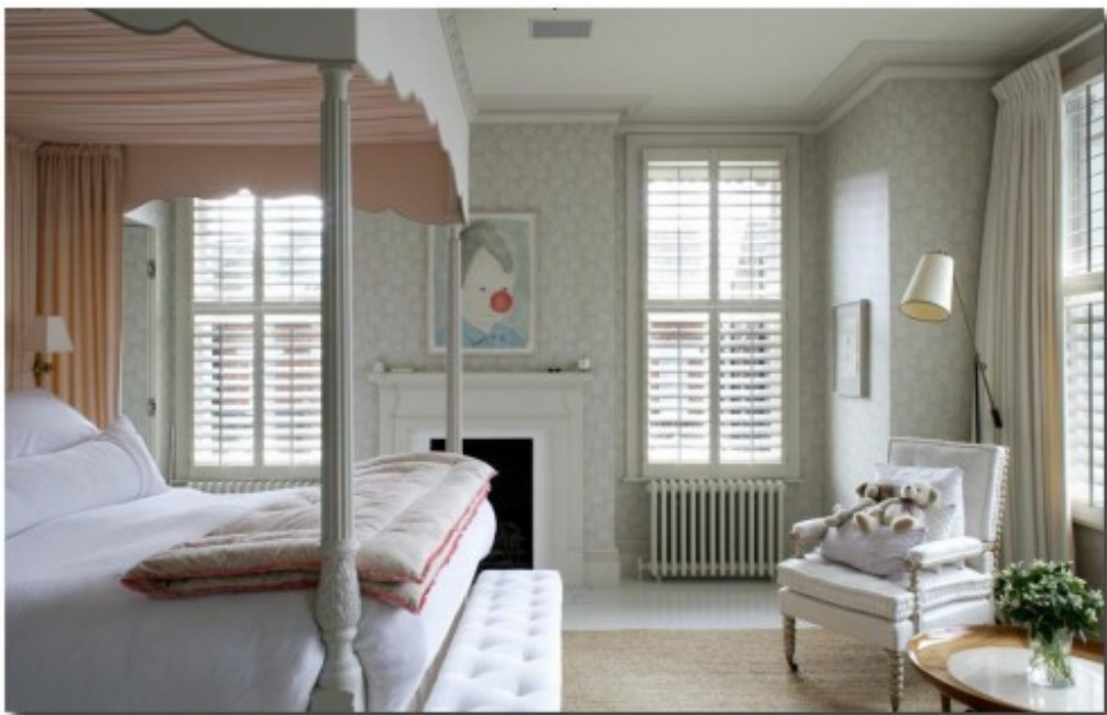
Annabels House White Decorating Ideas 1st-option.com