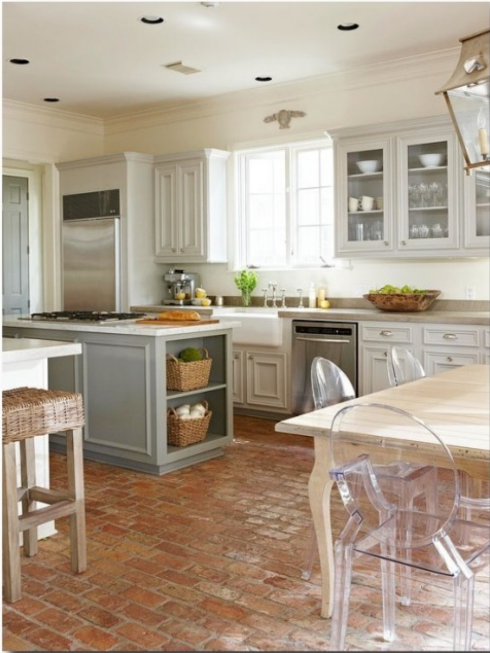
Sally Wheat Interiors, - bhg.com