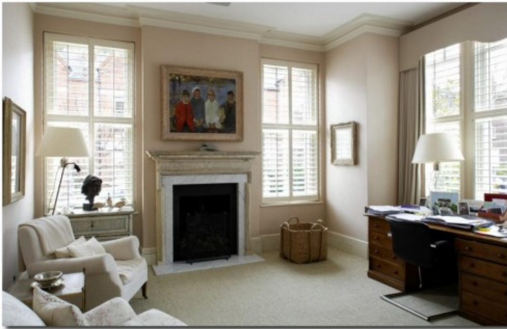
Annabels House White Decorating Ideas 1st-option.com