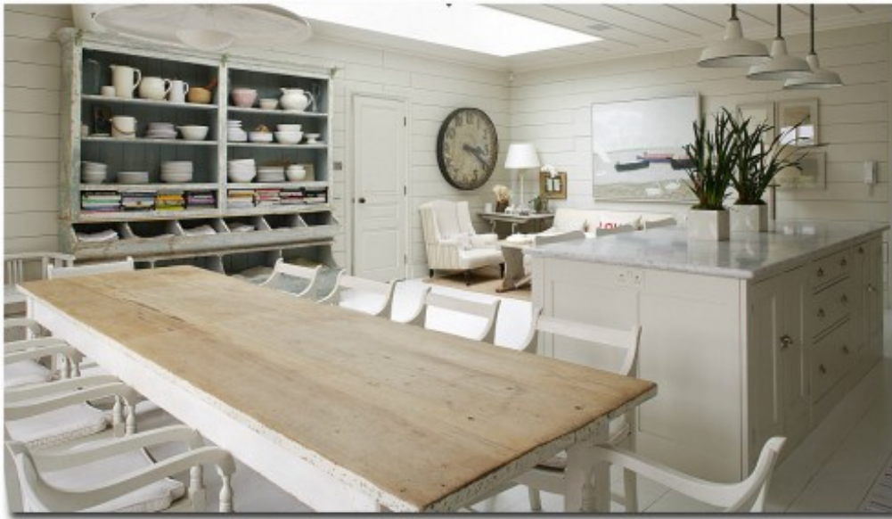
Annabels House White Decorating Ideas 1st-option.com