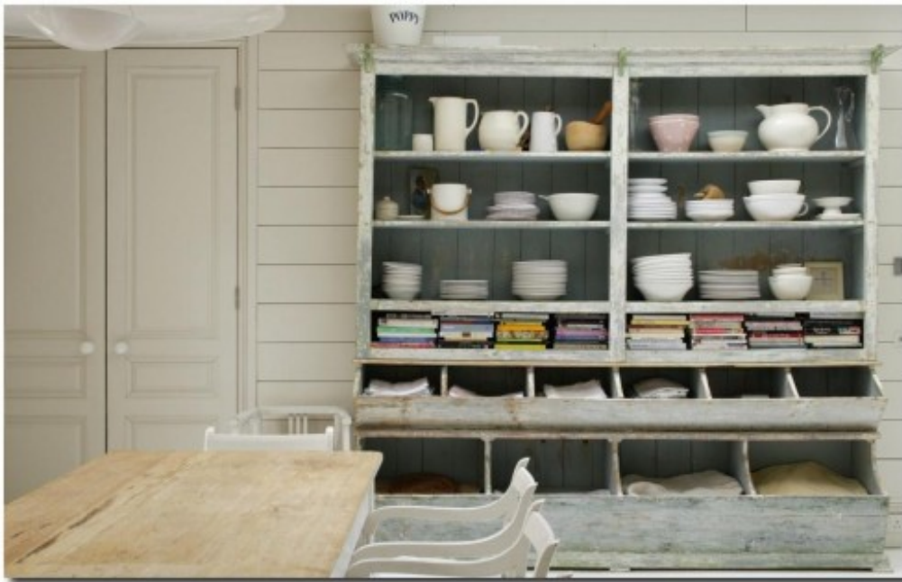
Annabels House White Decorating Ideas 1st-option.com