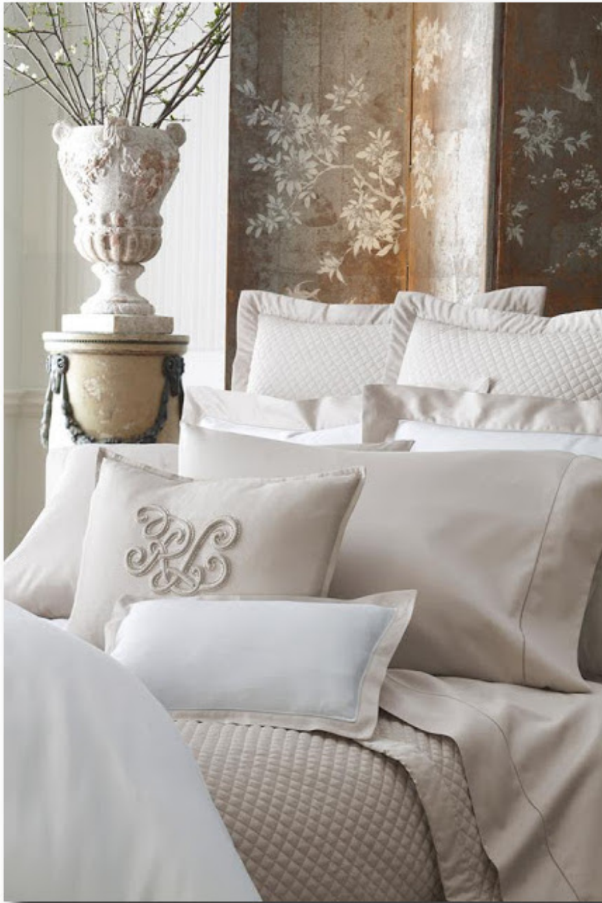
The Ralph Lauren Signature Classics Line