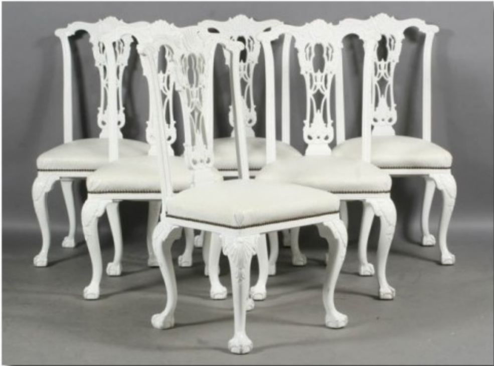
6 Chippendale White Dining Chairs Seen on Live Auctioneers

Unlike decorating kitchens and living rooms, decorating bathrooms is a bit more challenging. First of all, there's one thing you should be aware of: bath furniture is prone to extreme humidity, so it's extremely important to select waterproof pieces. Avoid hardwood because it's expensive and it will bloat. Why throw important sums of cash out the window when you can stay safe with additional materials like plastic, bamboo, and wicker?