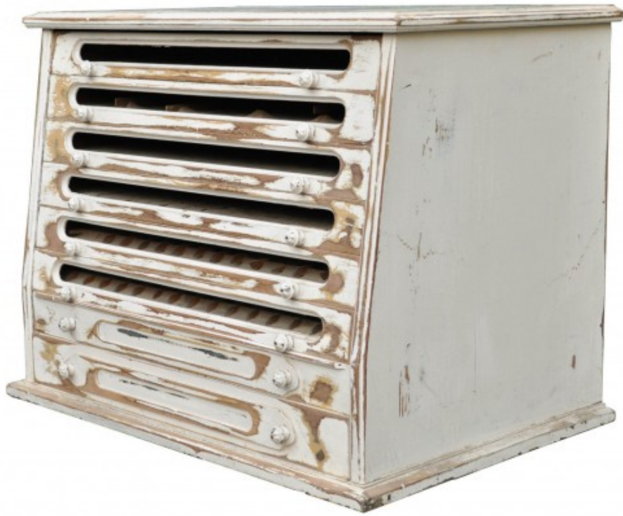
Primitive Chest From Quality Is Key On Ebay