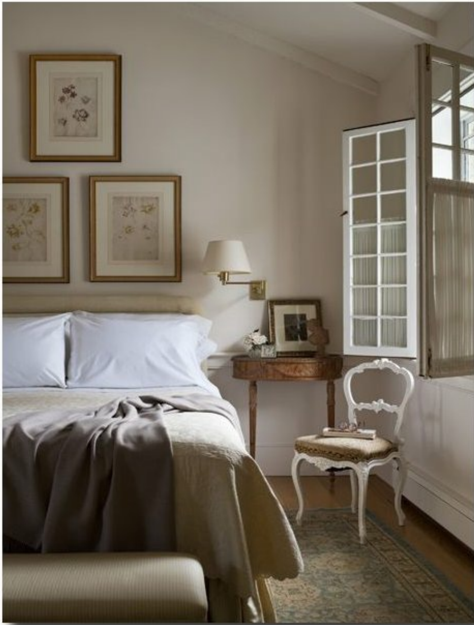
The shutters add character to the room