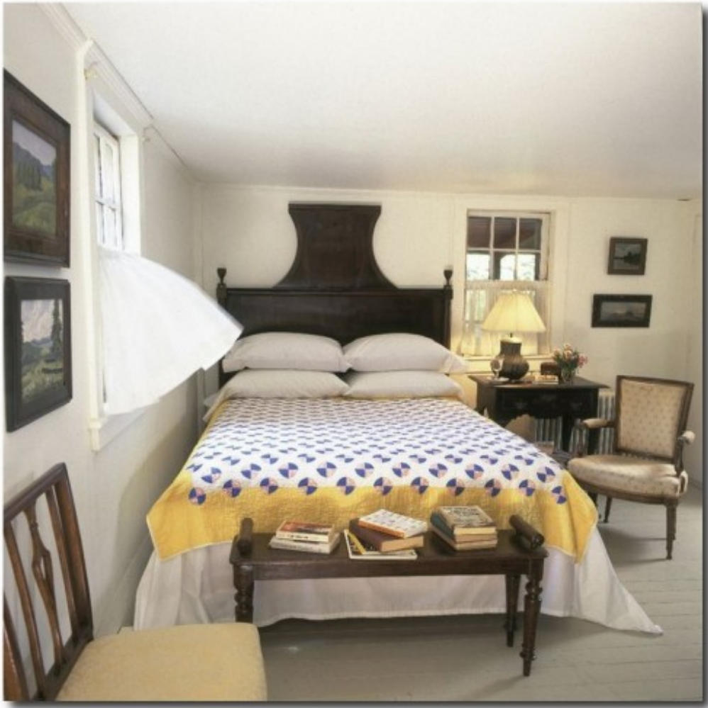
Charles Spada Visit charlesspada.com