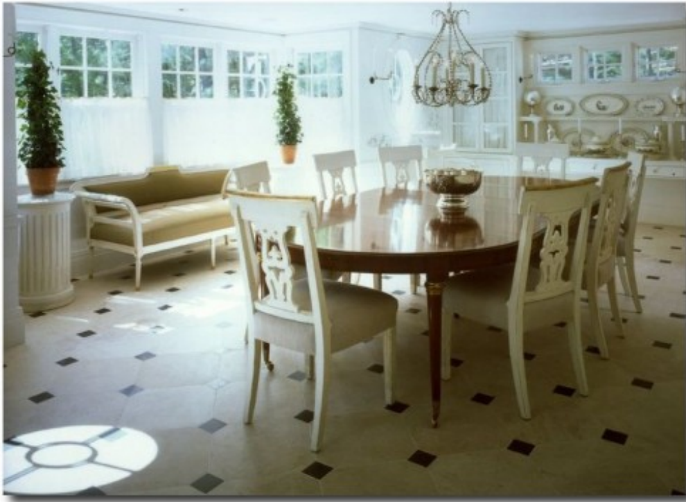
Charles Spada Visit charlesspada.com