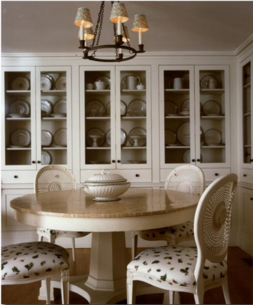
Featured in Veranda