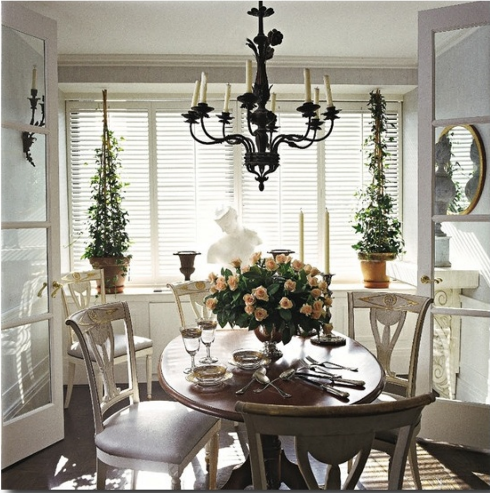
Charles Spada on Pinterest