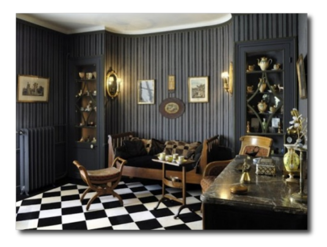
Maurice Ravel's French Styled Home