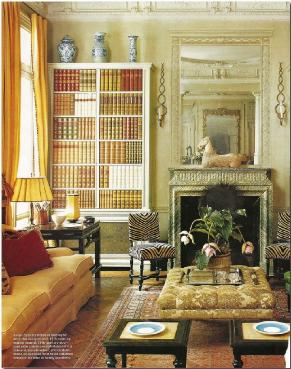
A Han dynasty horse is displayed atop the living room's 17th-century marble mantel. 18th-century abornized side chairs are upholstered in a zebra-stripe silk velvet, and custom-made bookcases hold false volumes whose titles refer to family members.