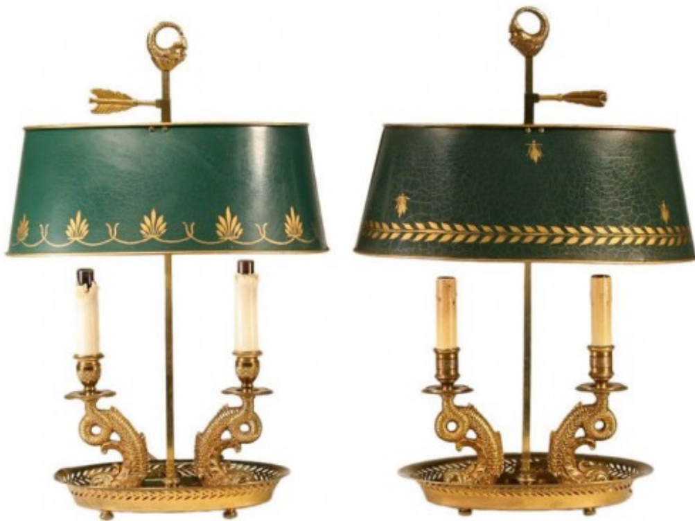
Bouillotte Lamps