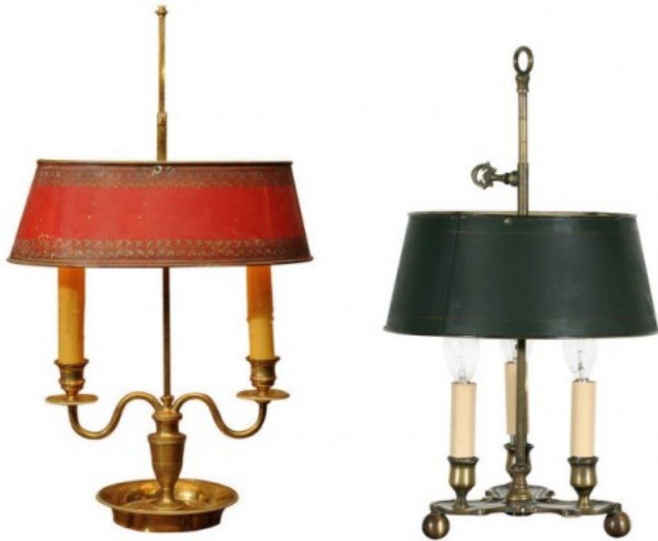
Louis XVI Style Brass and Tole Bouillotte Lamp Southall Antiques