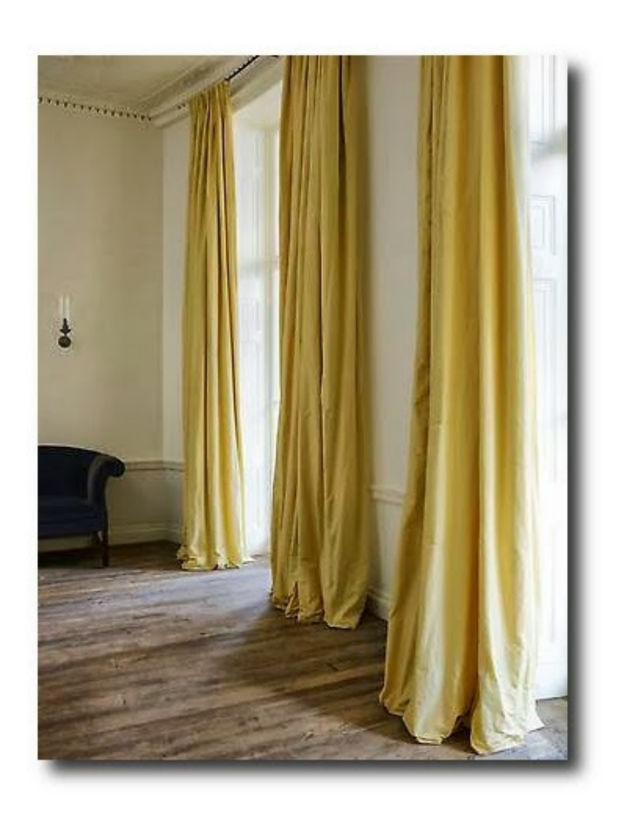
Designer Rose Uniacke's shop on Pimlico Road