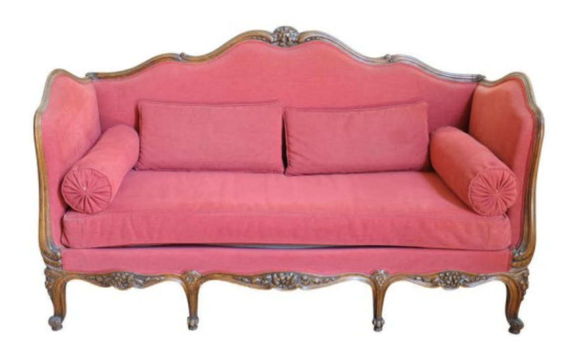
French Late 19th Century Louis XV Style Sofa in Beech Wood Provenance Antiques