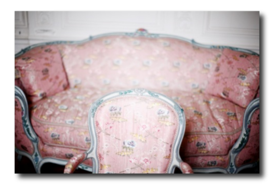
Pink Upholstered French Salon Set - parisapartment.wordpress.com