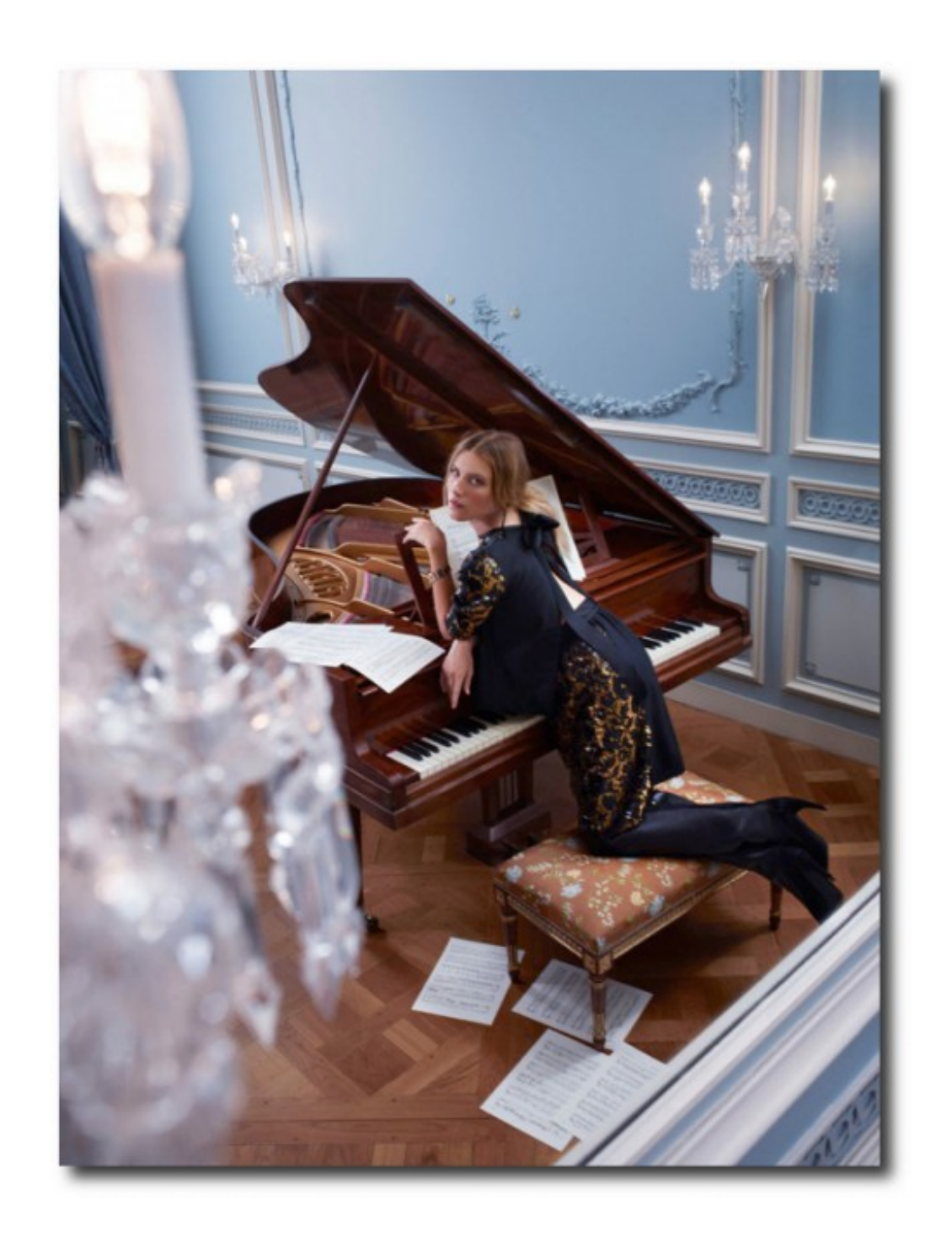
Dree Hemingway For Louis Vuitton Pre-Fall 2013