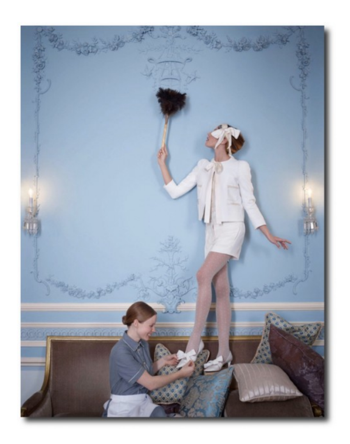
Dree Hemingway For Louis Vuitton Pre-Fall 2013