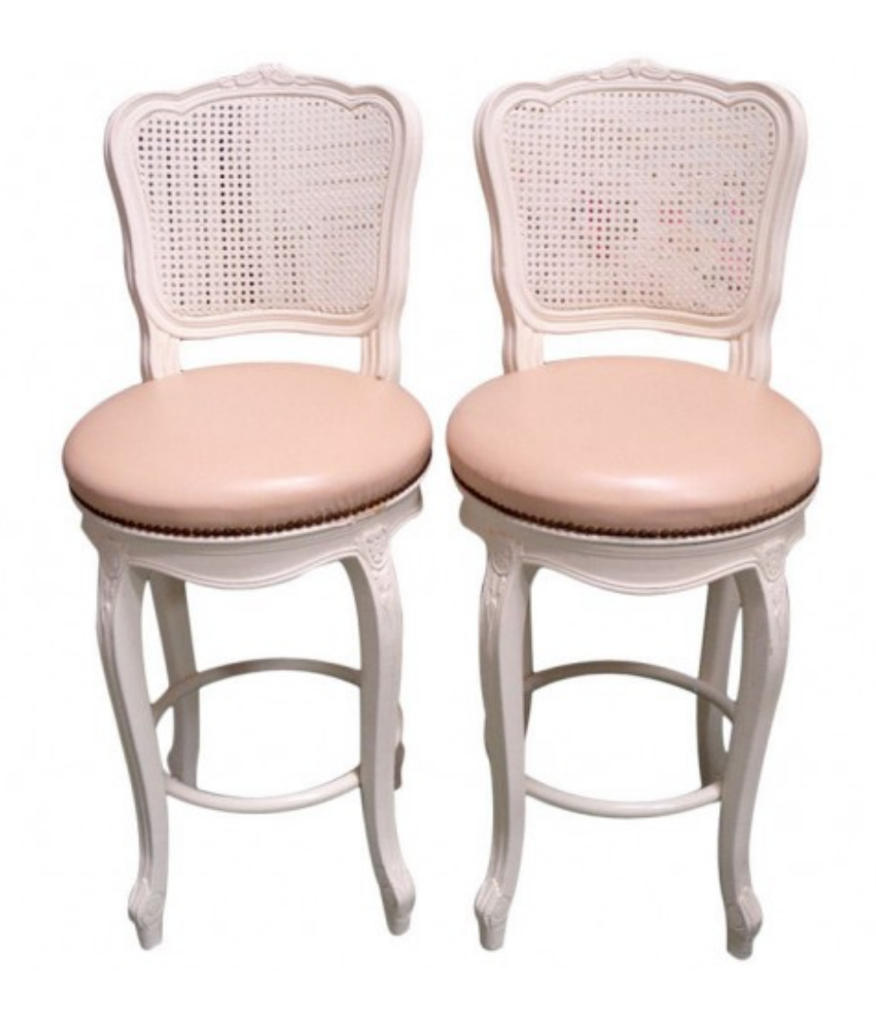
French Country Cane Back Bar Stools From Penny Long