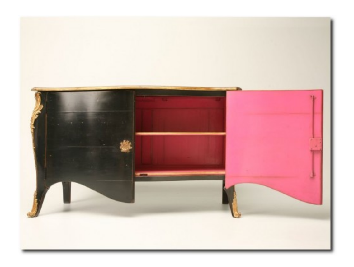
French Handmade Black Lacquered Buffet -Antiques on Old Plank Road