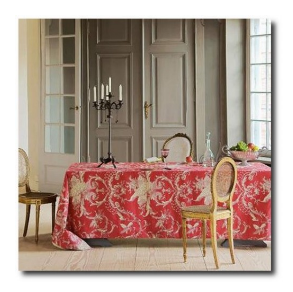
Vossberg- Tablecloth Fabrics