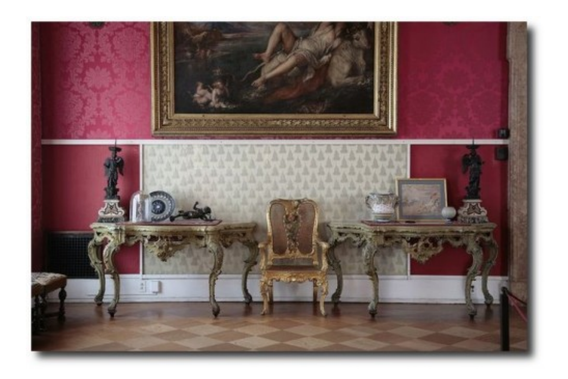
Isabella Stewart Gardner Museum