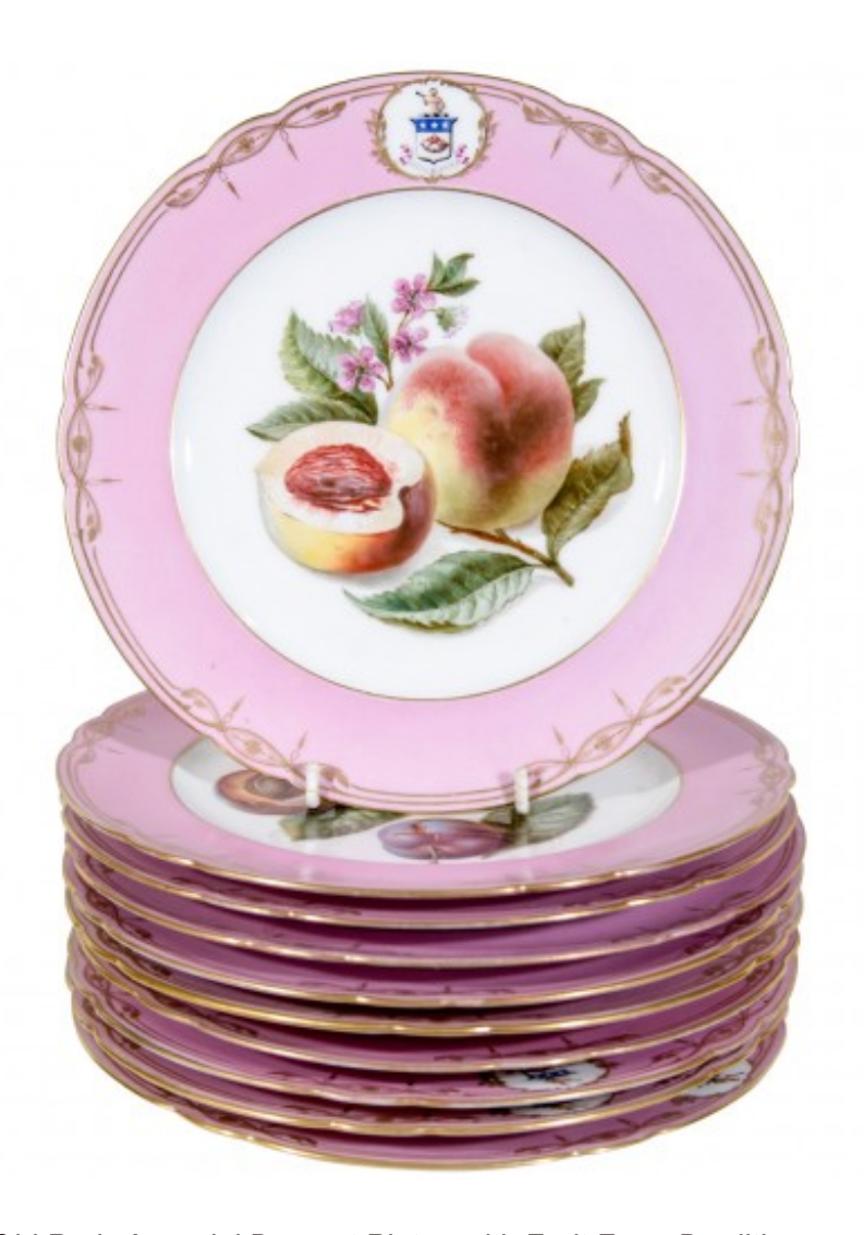
A Set of a Dozen French Old Paris Armorial Dessert Plates with Fruit From Bardith