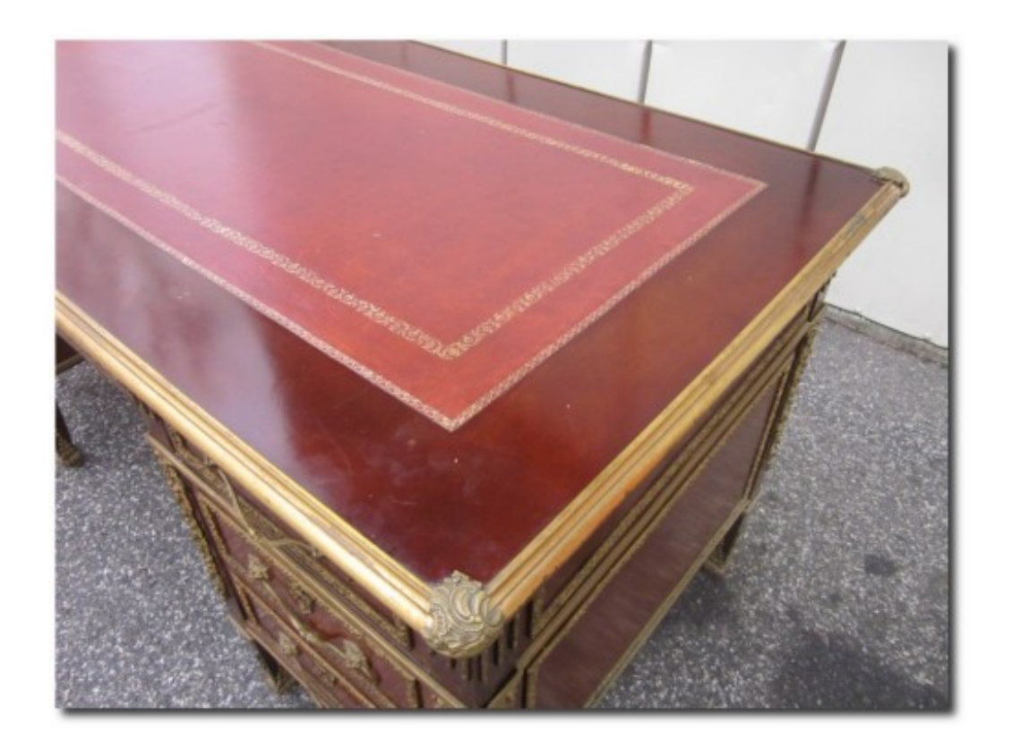
French Empire Style Desk with Leather Top Flavor