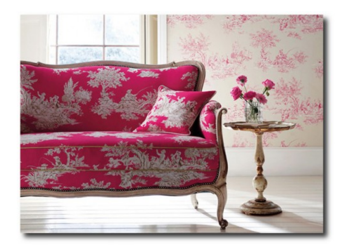
Harlequin Fabrics Toile