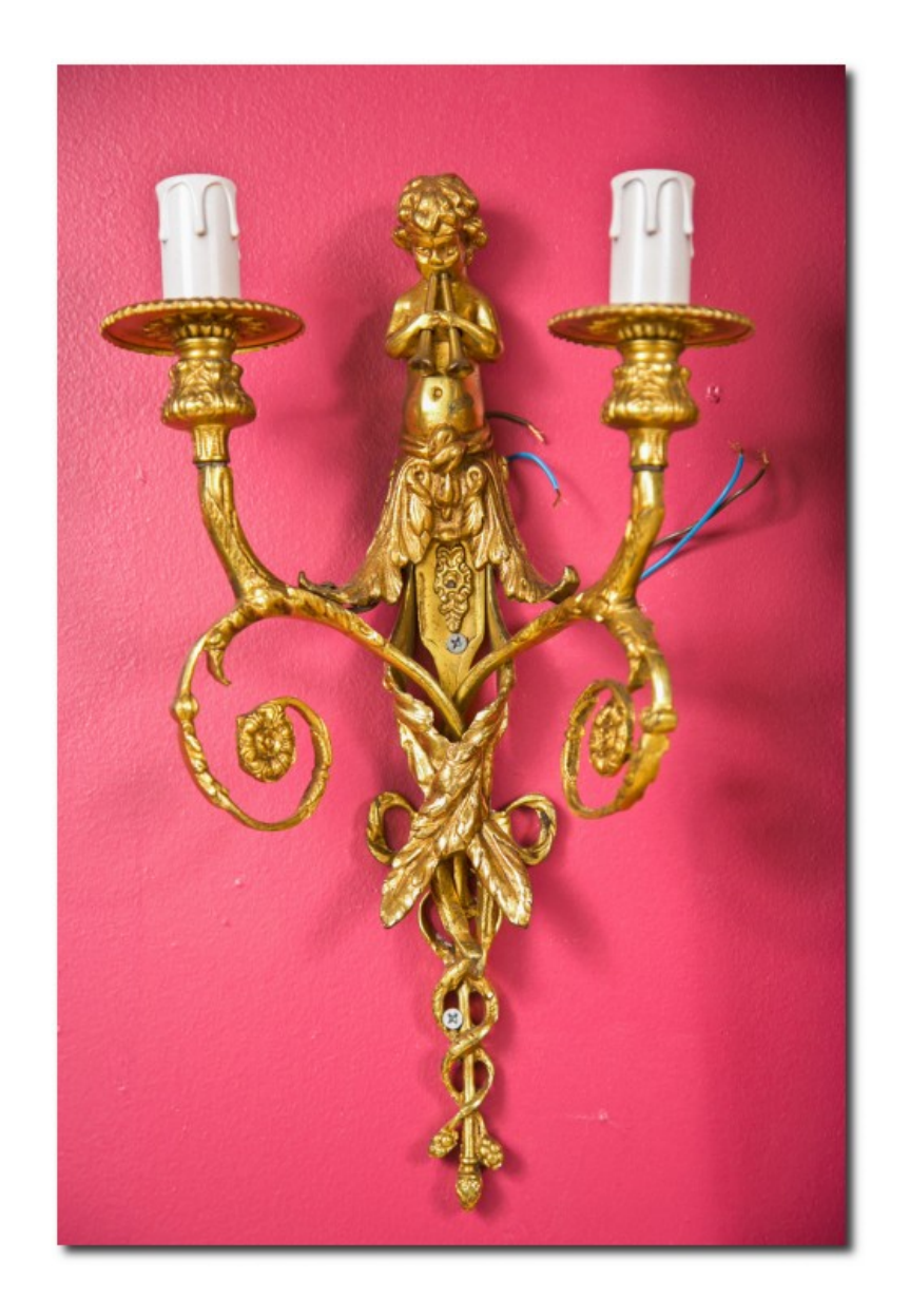
Set of 4 French Belle Epoque Gilt Brass Wall Sconces -Greenwich Living Antiques & Design