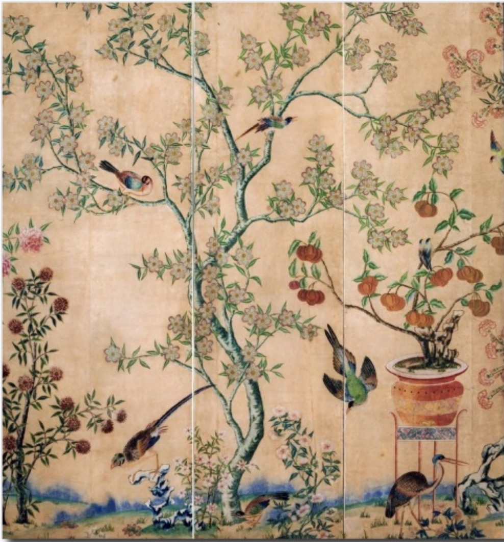
A rare set of Chinese painted wallpapers, formerly hung in colonial Williamsburg. Chinese for the European Market. Second Half of the Eighteenth Century