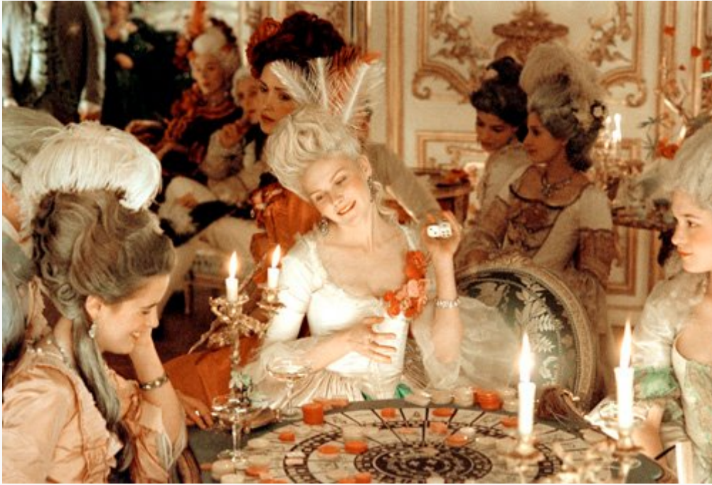
Marie Antoinette Staring Kirsten Dunst-The retelling of France's iconic but ill-fated queen, Marie Antoinette.