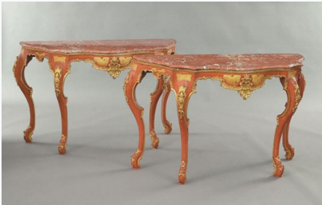
Venetian Rococo Painted Gilded Marble Console Tables

A Pair of Venetian Rococo Painted and Gilded Marble Top Consoles, each with serpentine top, scalloped shell and floral carved skirts, flared floral carved knees From The Neal Auction Company