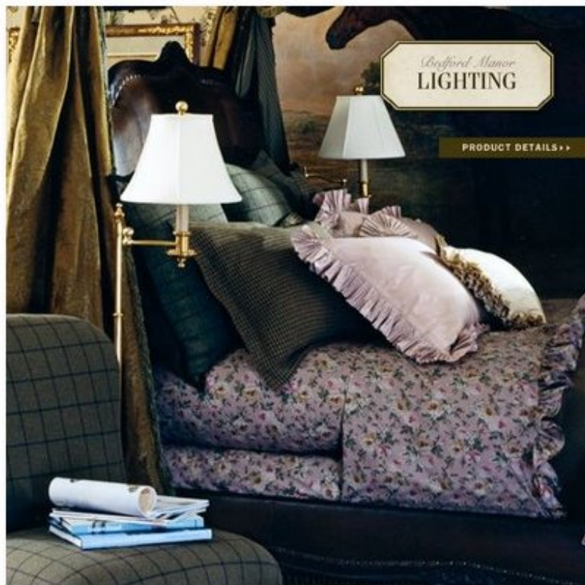
Bedford Manor Collection, 2008