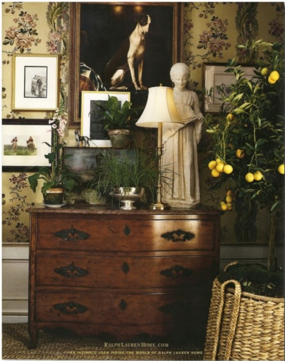
Ralph Lauren Home- Bedford Manor Collection, 2008