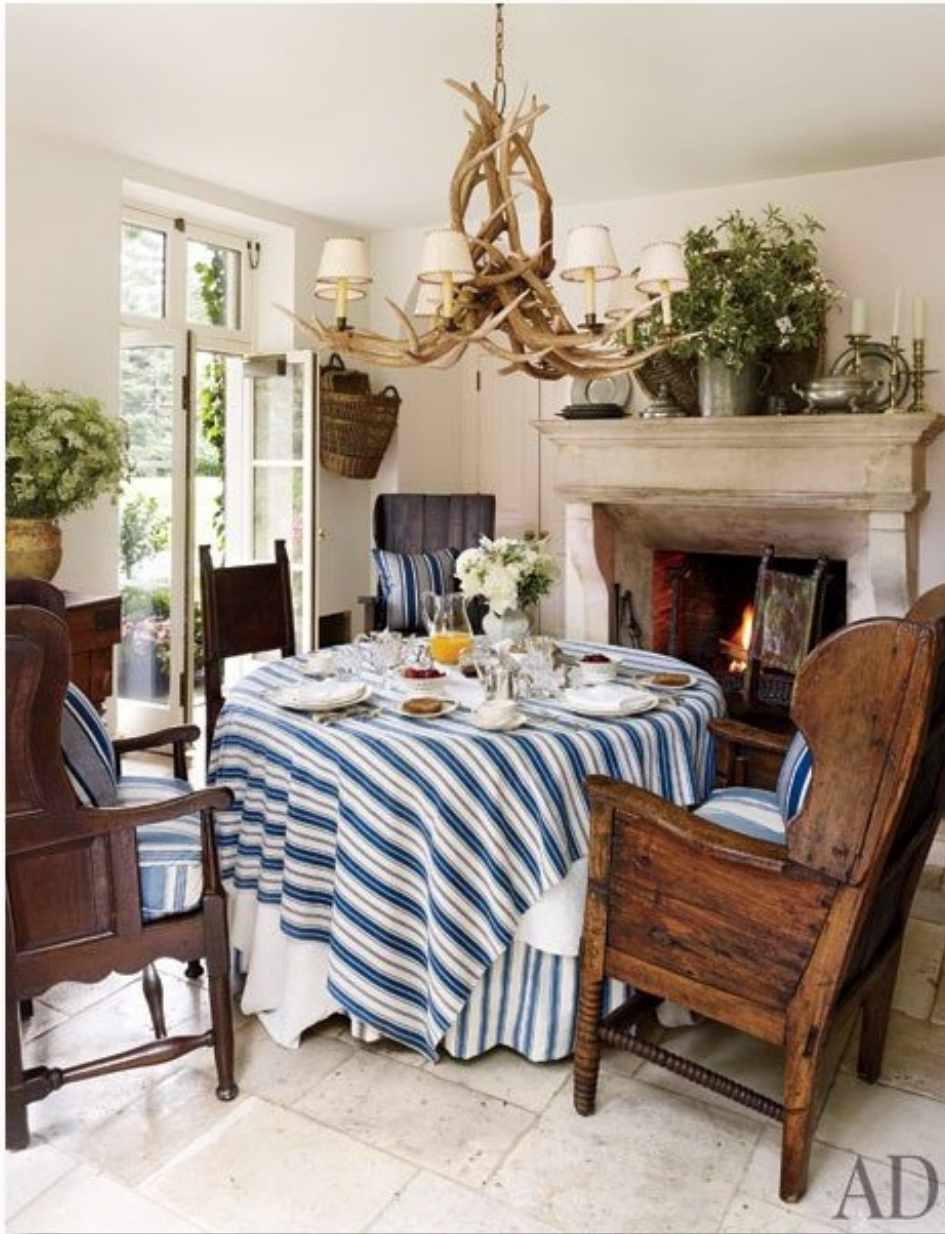
Ralph Lauren's Chic Homes and Office www.architecturaldigest.com