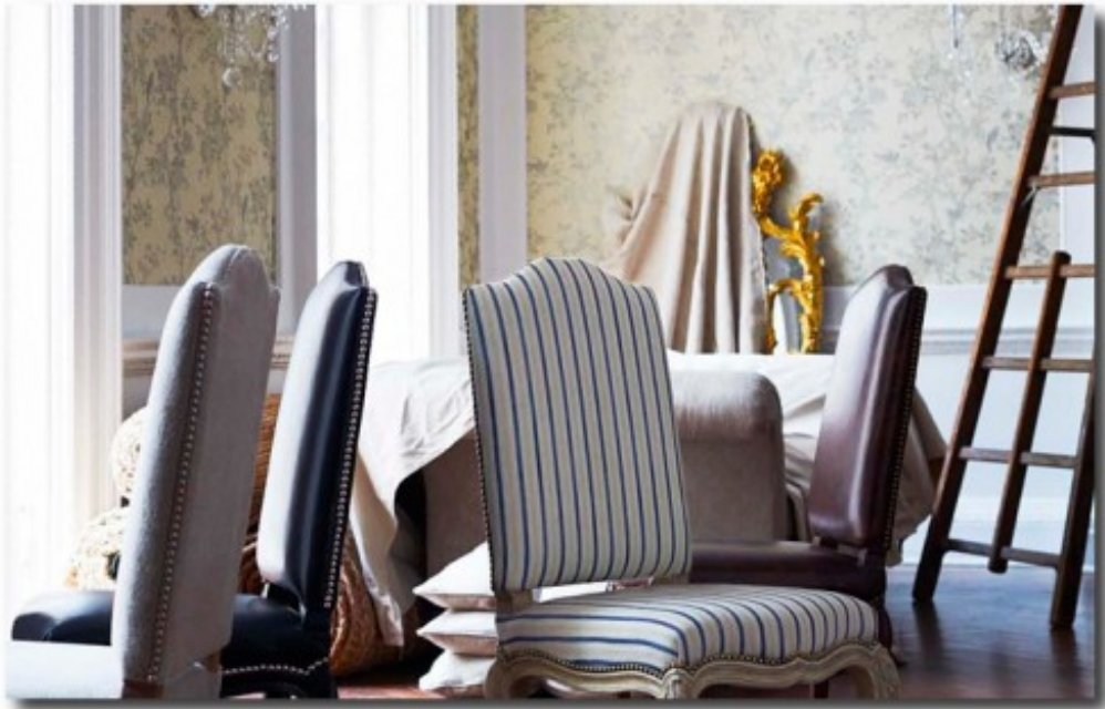
Kravet Collections Ralph Lauren Home www.kravet.com