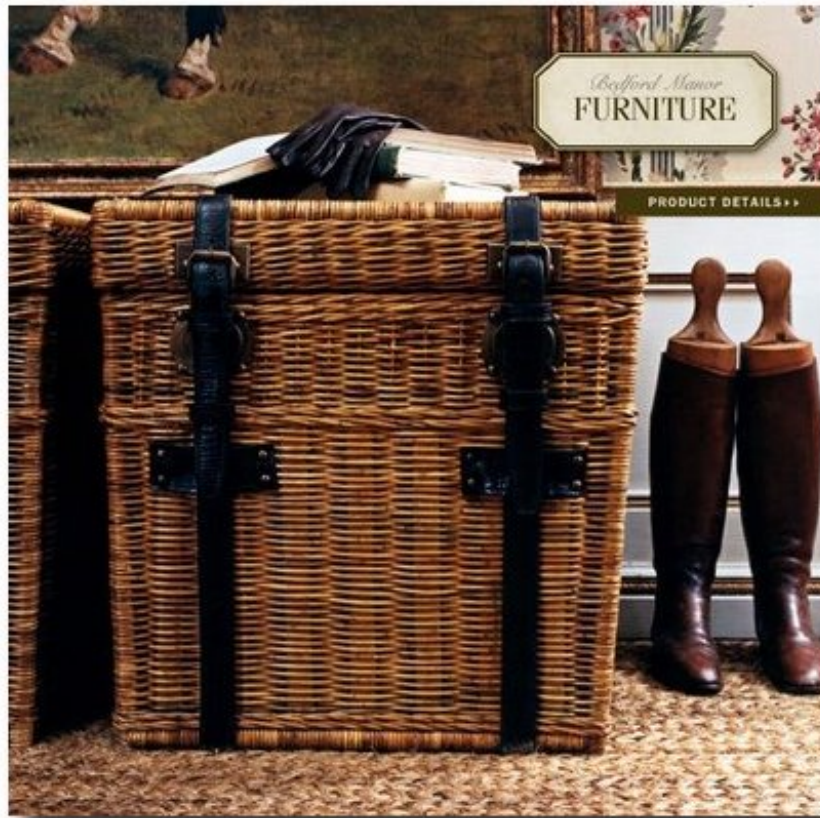
Bedford Manor Collection, 2008