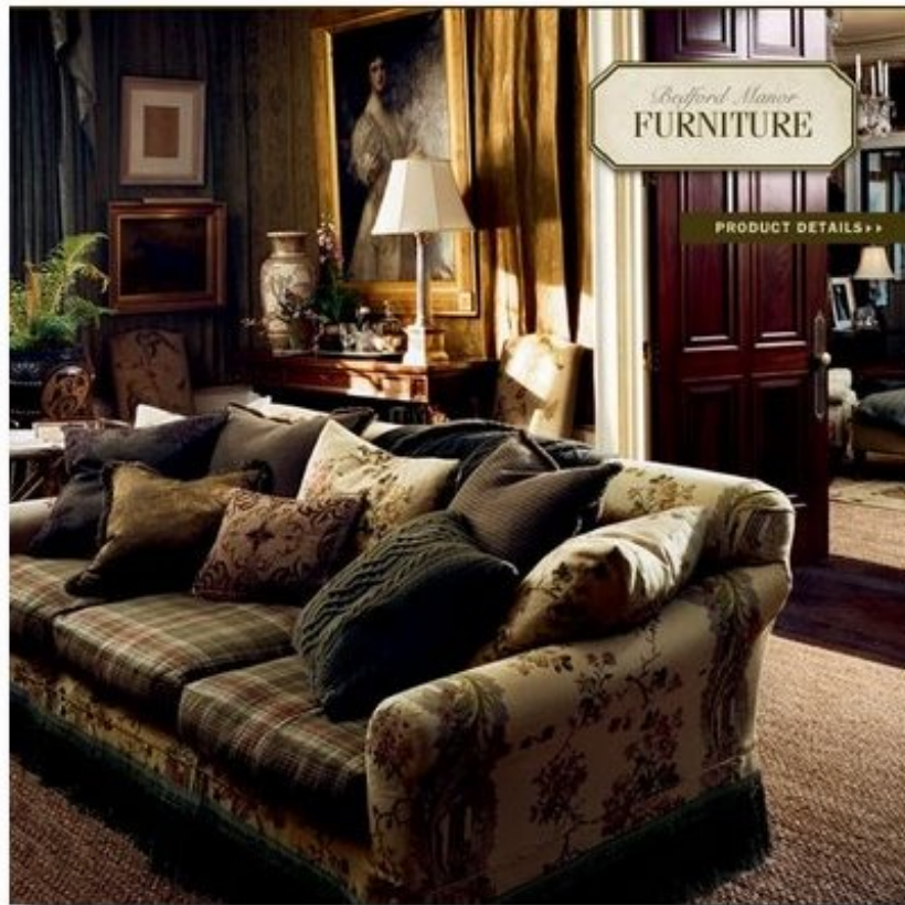
Bedford Manor Collection, 2008