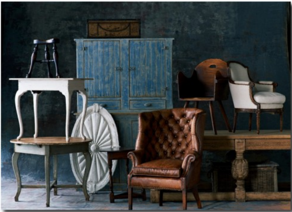
Ralph Lauren Home