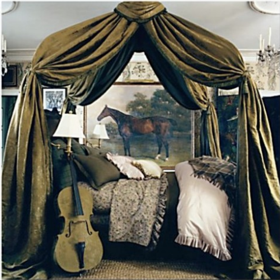
Bedford Manor Collection, 2008