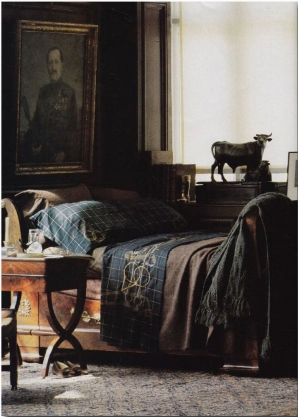
1984. Photo by Bruce Weber Seen On The Art Of The Room Blog