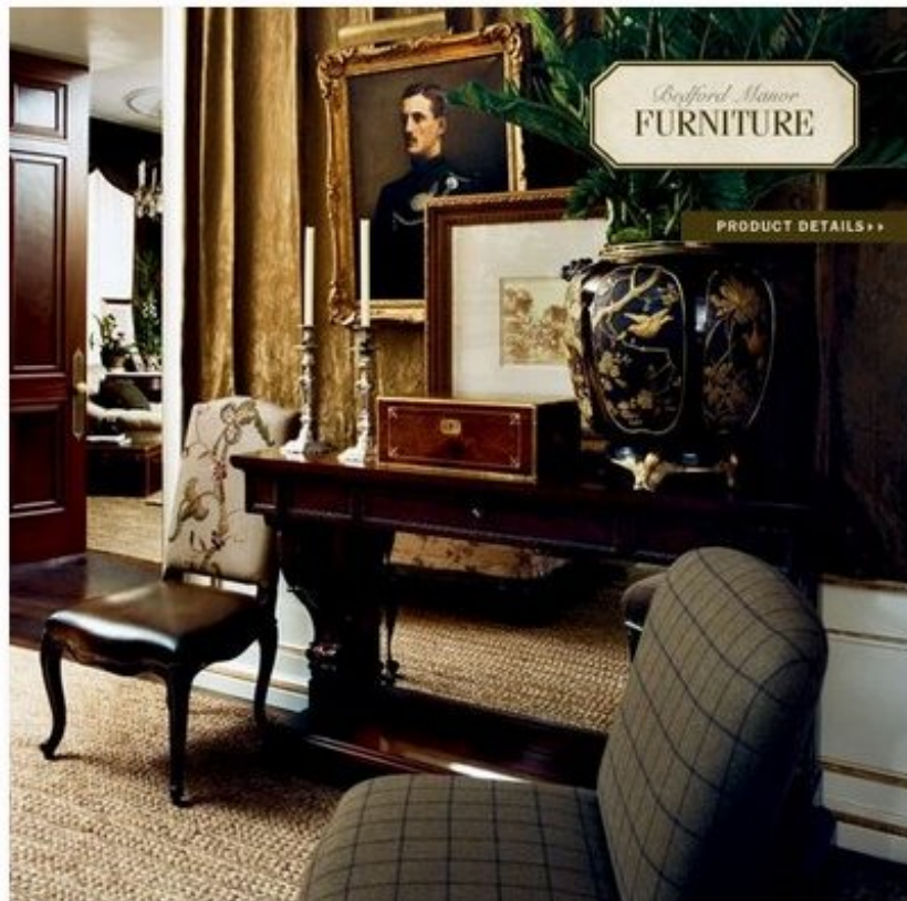
Bedford Manor Collection, 2008