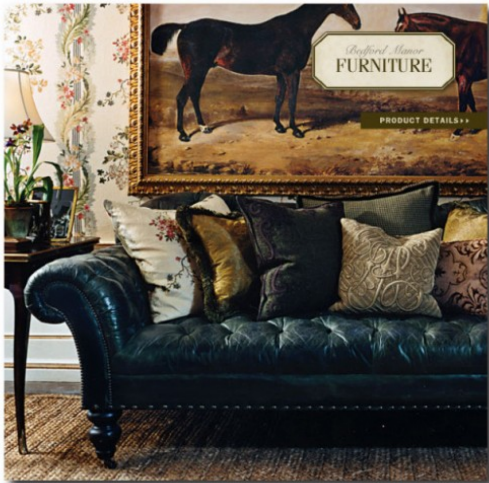
Bedford Manor Collection, 2008 -Seen On The Art Of The Room Blog