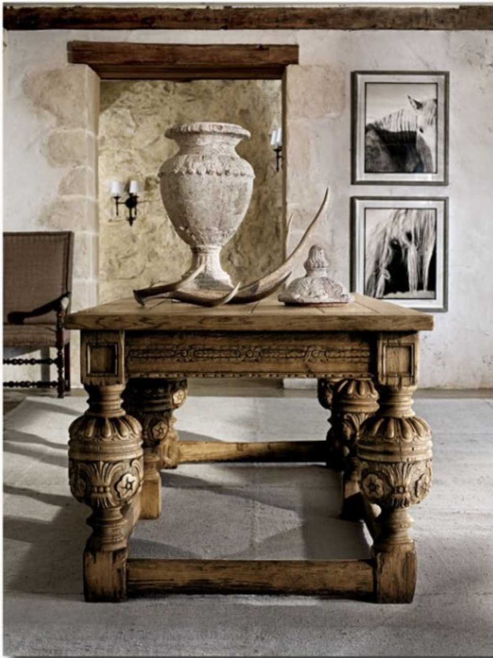
Ralph Lauren Home