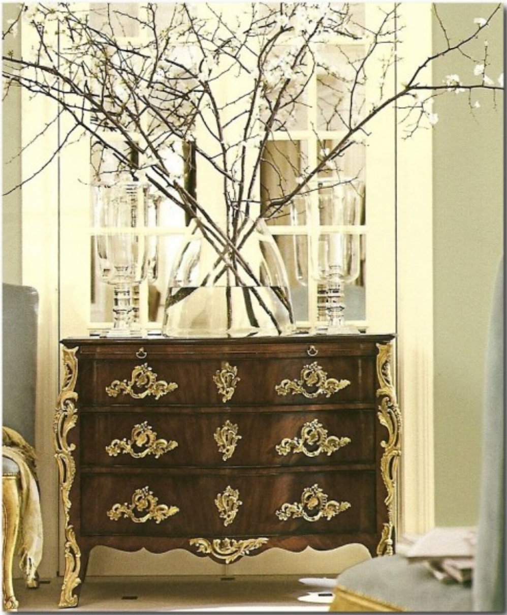
Ralph Lauren French Chest