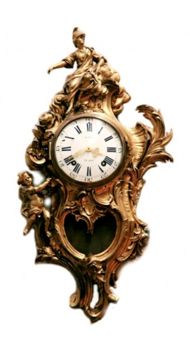
Baroque Cartel Clock